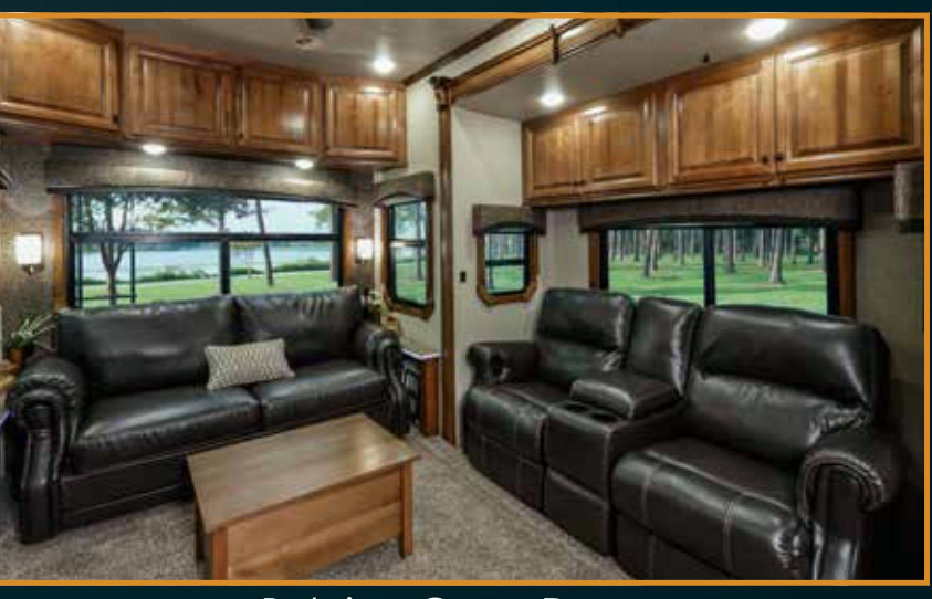
Belgian Coco Decor