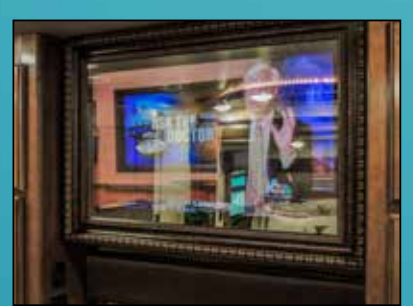
Bedroom TV mirror