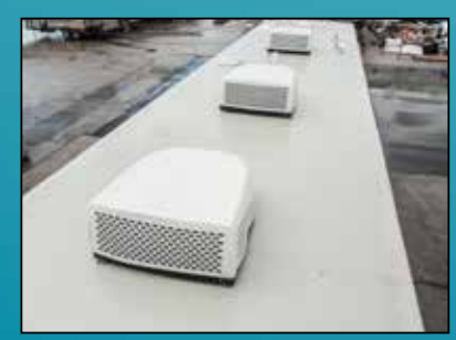
45,000 BTU cooling