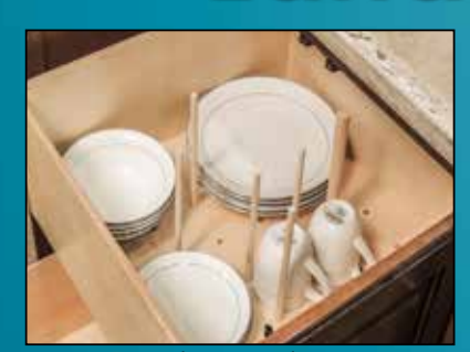
Peg storage drawer