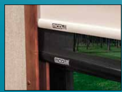
Privacy trim on windows