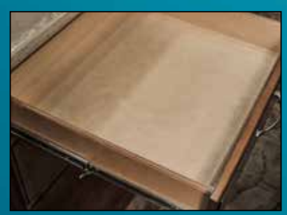
Solid maple drawer boxes