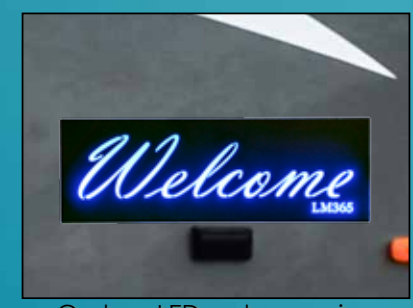
Custom LED welcome sign