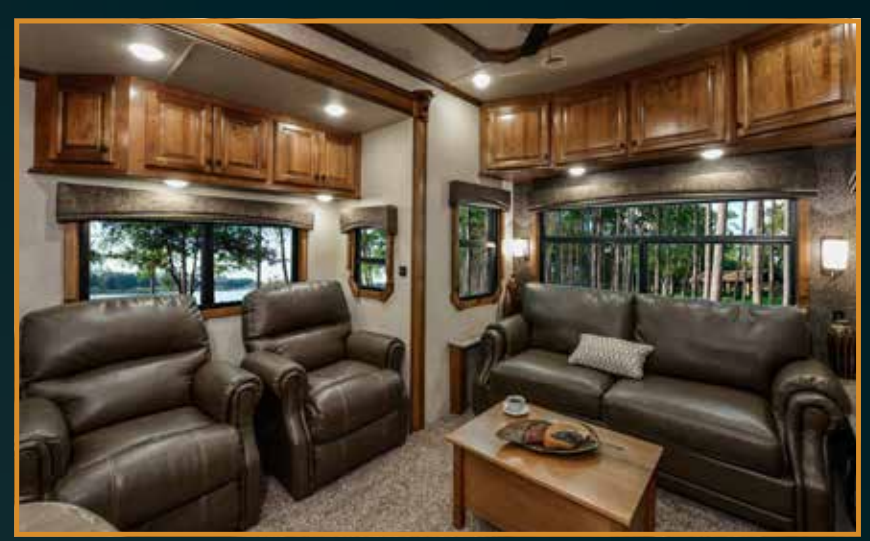
English Slate Decor