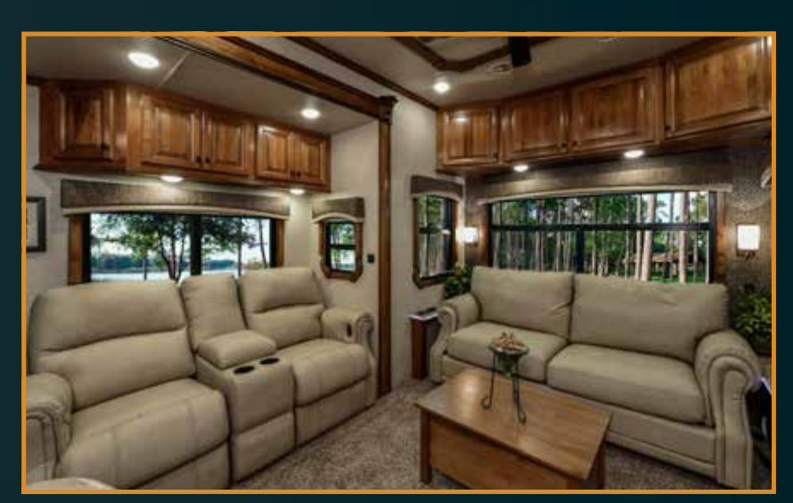
Moroccan Sand Decor