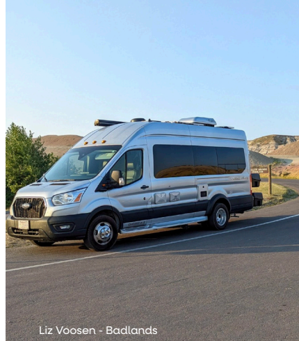
Liz Voosen - Badlands