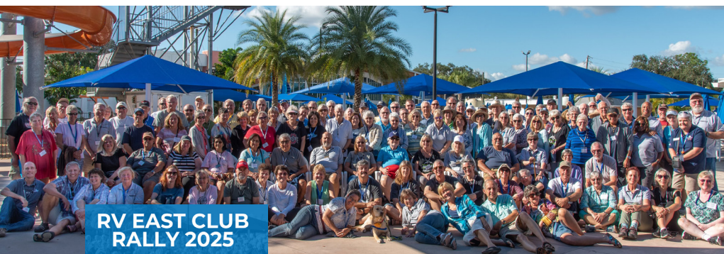
RV EAST CLUB RALLY 2025

Traveling in a Pleasure-Way motorhome offers unique advantages over traditional RVing in larger Class A, Class C, or towable trailers. Whether you're a seasoned full-timer or just beginning your RV journey, something has drawn you to the Pleasure-Way lifestyle. Along the way, you'll create lasting memories, forge new friendships, and collect stories worth sharing.