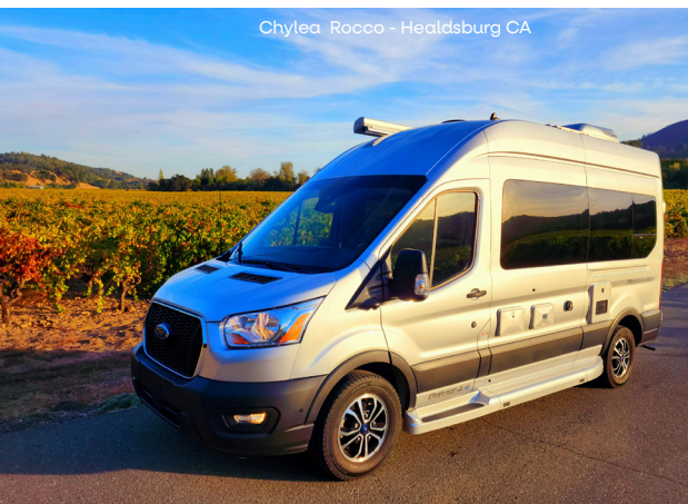
Chylea Rocco - Healdsburg CA

The Pleasure-Way owners' clubs are proudly operated by fellow owners and enthusiasts just like you who share a deep passion for RVing. We believe that meeting new friends and sharing adventures is an important part of the Pleasure-Way experience. A lovely group of owners have created East and West based group who actively participate in rallies and group meet-ups!