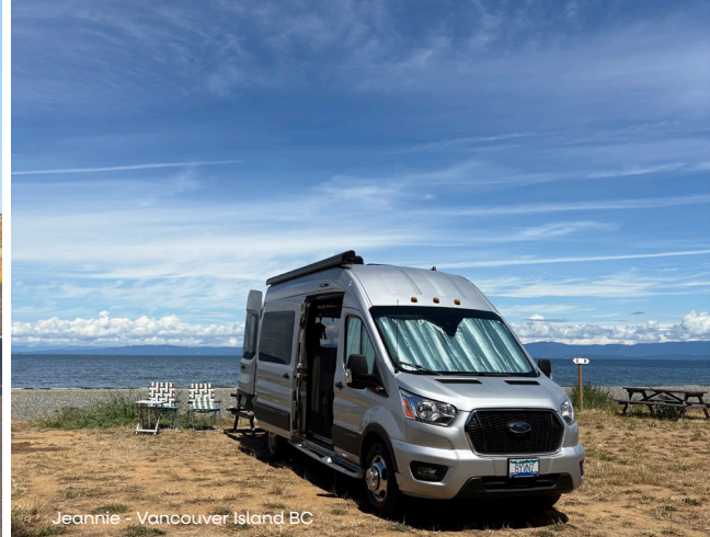
Jeannie - Vancouver Island BC