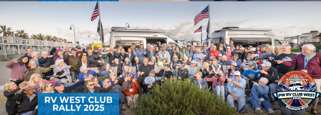
RV WEST CLUB RALLY 2025