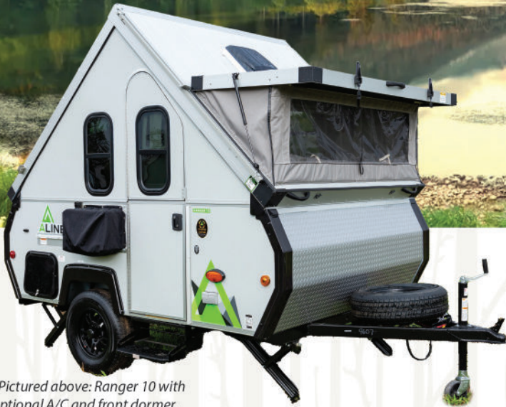
*Pictured above: Ranger 10 with optional A/C and front dormer.

Introducing the Aliner Ranger Series —your gateway to easy, no-fuss camping. Compact yet fully equipped, the Ranger is designed for campers who want more freedom on the road without the extra weight. With a lighter frame and essential features like a 5,000 BTU side-mounted A/C, a 2-burner stove, and fresh water storage, this camper is all about simplicity and efficiency. Its rugged build and high wind lift assist make setup a breeze, whether you're camping for a weekend getaway or venturing off-grid. Perfect for those who want adventure without over-complication, the Ranger Series gives you everything you need to hit the road and explore.