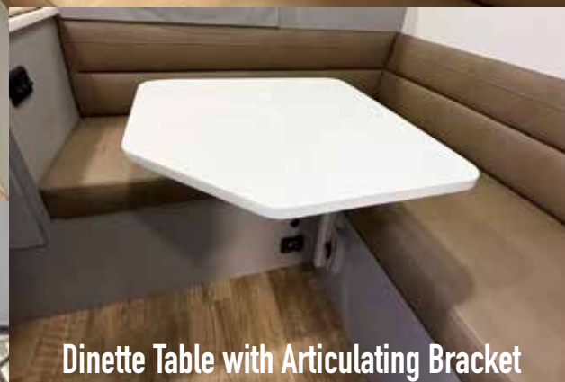
Dinette Table with Articulating Bracket

These are not your typical truck camper dinette cushions! Soaring Eagle Campers spared no expense in designing the new AERIE camper, including paying to upgrade to automotive grade foam in our luxurious dinette seating. Covered in soft faux leather with elegant stitching and design lines, you will feel like you are sitting on your couch at home, not in a camper.