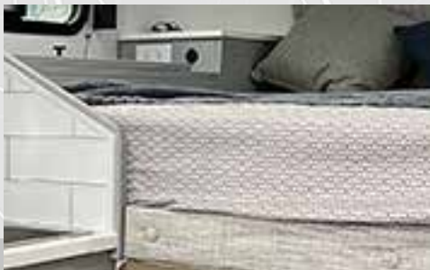
RESIDENTIAL STYLE MATTRESS

Night stands on both sides of the bed feature 110V outlets and 12V/USB chargers, plus reading lights.