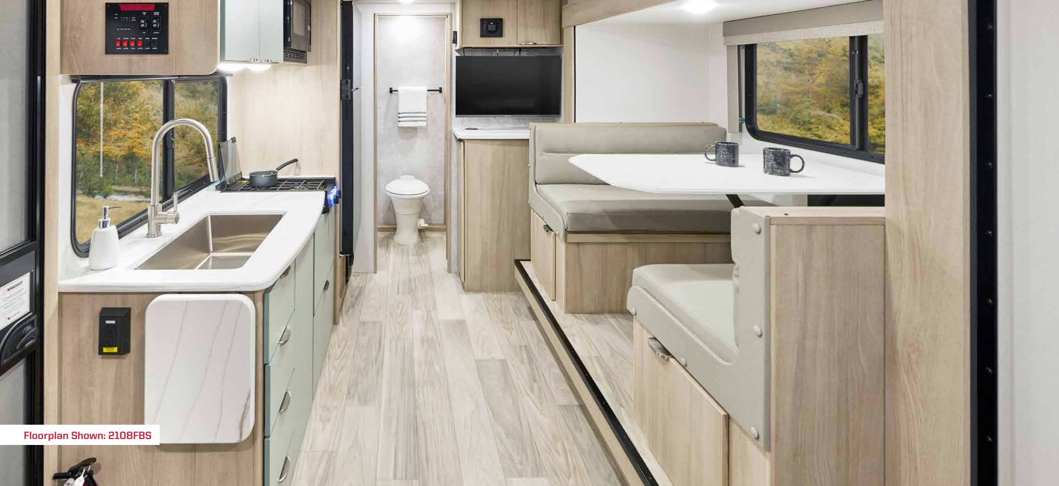
Floorplan Shown: 2108FBS

An intuitive control panel saves steps by locating key system controls in one convenient location.