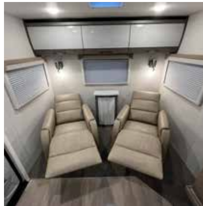
Lounge-Style Recliners in Model 2565