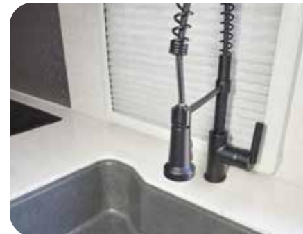
Residential faucet fixtures.