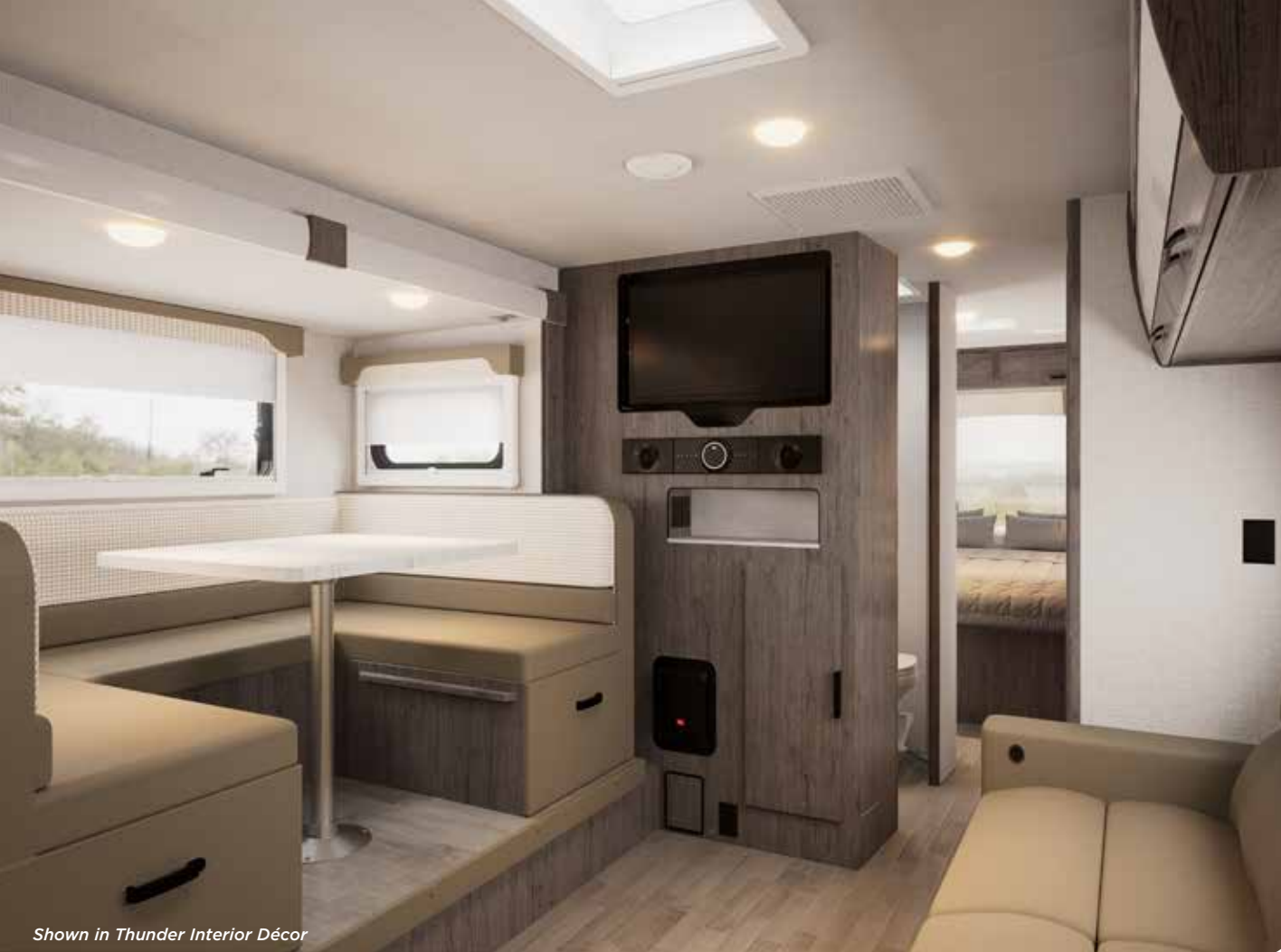
Shown in Thunder Interior Décor