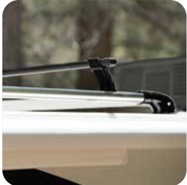
Lance Load Roof Rack System. Bring your kayak, canoe, or extra storage pod along for the adventure.