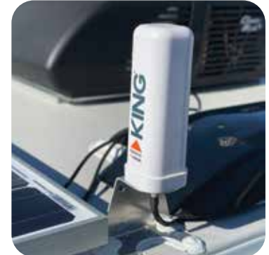
Antenna LTE/cell booster. It improves your cell phone's voice and data range, potentially allowing it to function as a Wi-Fi hotspot.