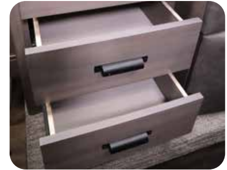
Real 3/4" formaldehyde-free wood in all interior walls and cabinetry. Soft close hardware.