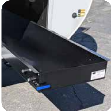
Pull-Out Storage Tray (MorRyde). There is no need to climb in to access this large compartment.