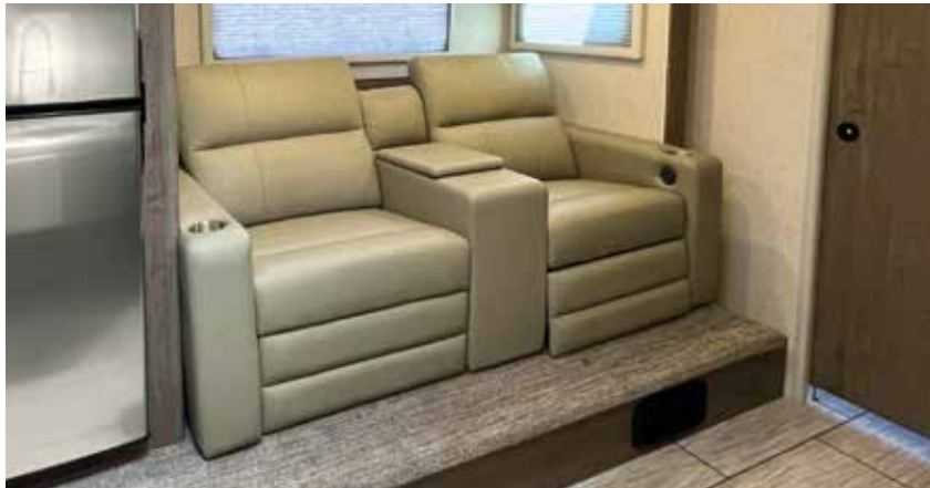
1685, 1985, 1995, 2185, (2255 shown), 2445 Theatre Seating Option

Comfort is king. The best comfy relaxation spaces are perfect for napping, reading, working from home, or watching TV. Our various floorplans include options for comfort, beauty, form, and function, with multiple options in some layouts. After a day out in the great wide open or during inclement weather, you can enjoy options such as captain's chairs, full reclining theater seating, bedroom convertible sofas/beds, and/or sofa sleepers for guests.