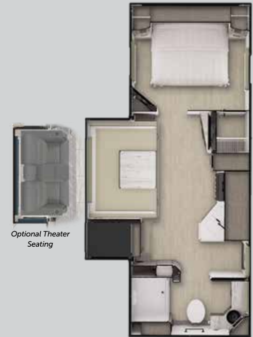
Optional Theater Seating