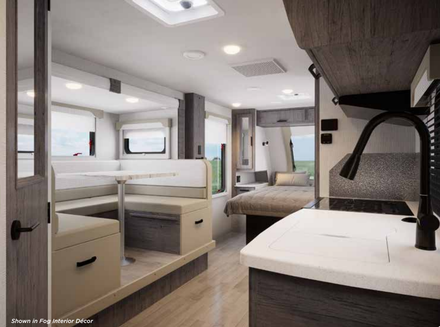
Shown in Fog Interior Décor