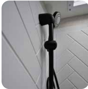
Shower Miser. Divert and circulate shower water while heating up, giving you the ability to stay out of your RV longer off-grid by conserving both your fresh and gray water.