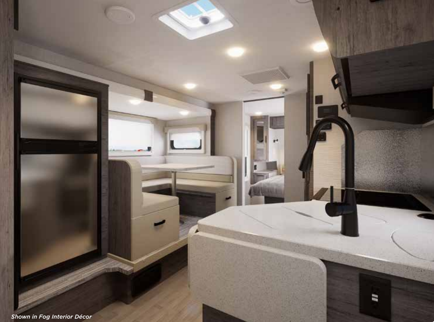
Shown in Fog Interior Décor