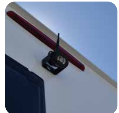
Backup Camera with Wireless Monitor. This enhances the enjoyment of the back-in and set-up process significantly.