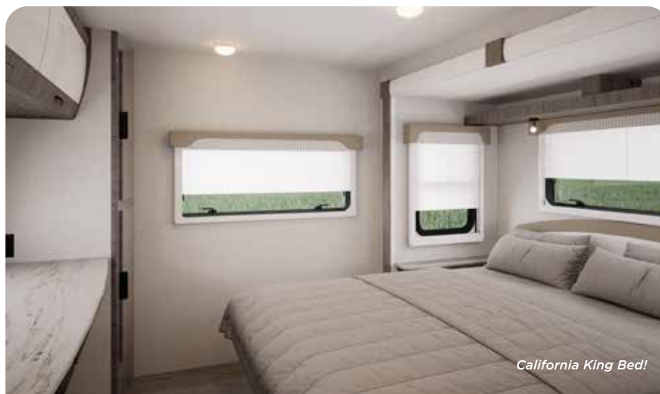
California King Bed!