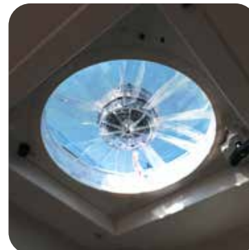
Full-bladed fan. Ensure your RV stays well-ventilated and dry in any weather condition.