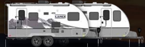
MODEL 1685 | 16'