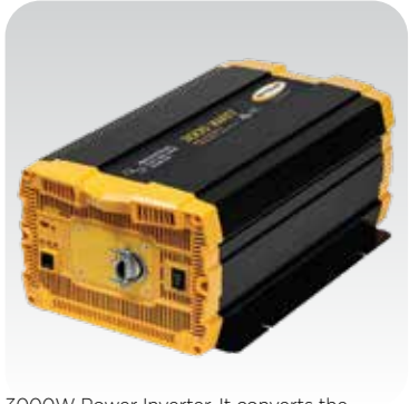
3000W Power Inverter. It converts the electricity from onboard batteries to allow the 110V system (outlets, A/C, microwave) to function off-grid.