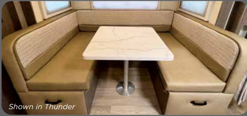
Shown in Thunder