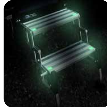
Glow-Step Revolution Entry Step: 25". An extra sturdy step that fully contacts the ground provides added support for entry and egress.