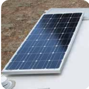
Optional solar power—choose one or two 200W panels to keep batteries charged and extend off-grid time.