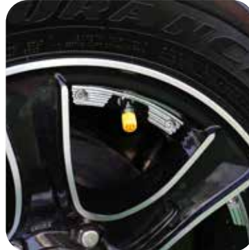
TPMS System (Tire Pressure Monitoring System). Monitor the pressure (PSI) in all four tires while going down the road.