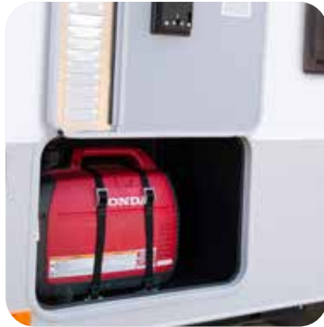
Portable Generator Storage Compartment with Tie-Downs and cable lock. It ensures the safe and secure transportation of a backup generator.