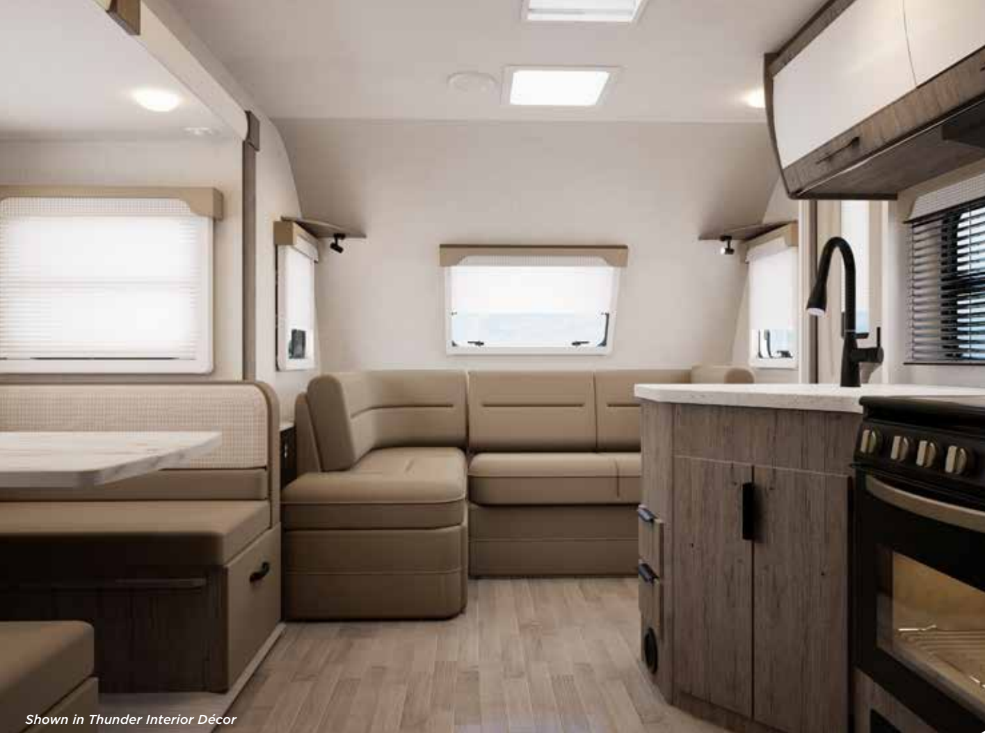
Shown in Thunder Interior Décor