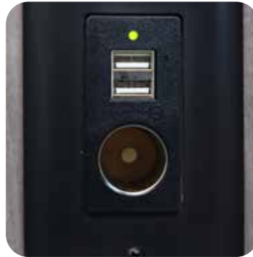
12V/USB Charging Port(s). Convenient access to even more charging locations for your devices.