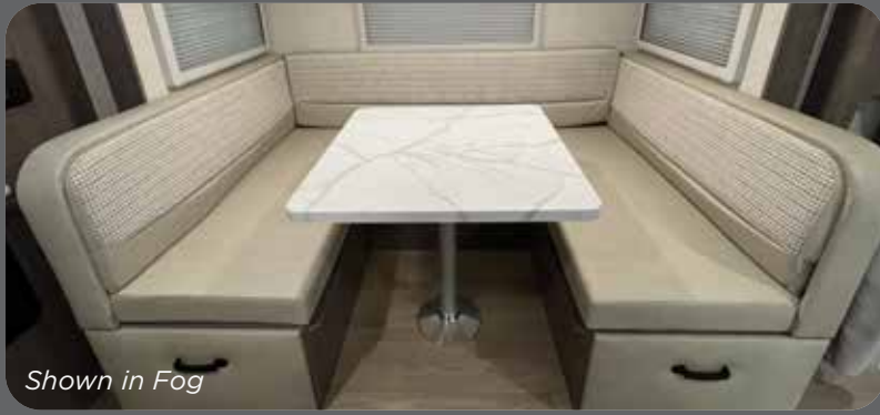
Shown in Fog