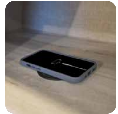
Wireless Cell Phone Charging Pad. Just set down your phone to charge it up.