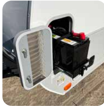
Locking Dual Battery Compartment(s) W/Sliding Tray (Design Is Model Dependent). Keep batteries insulated and safe.