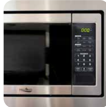
Convection/Micro-Air Fryer. It combines the rapid cooking capabilities of a microwave ovens with the browning and crisping of a traditional oven.