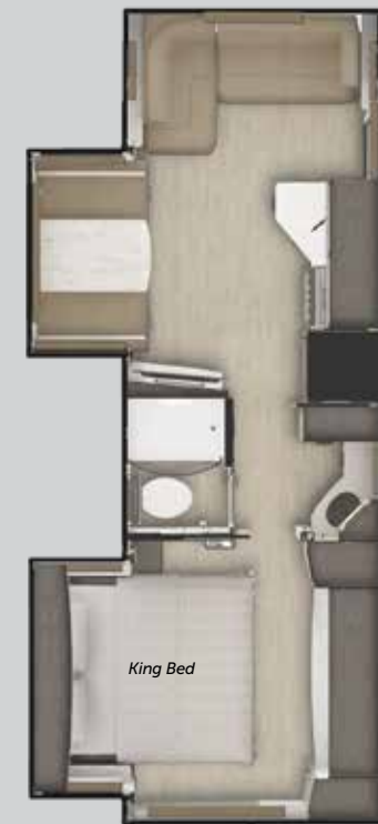
Sofa Bed Size 42" x 72"