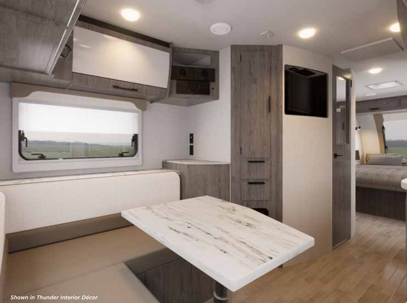
Shown in Thunder Interior Décor