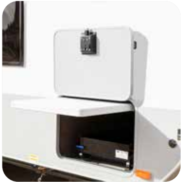
48" Portable Folding Table with Built-In Exterior Storage Feature. You know you need one!