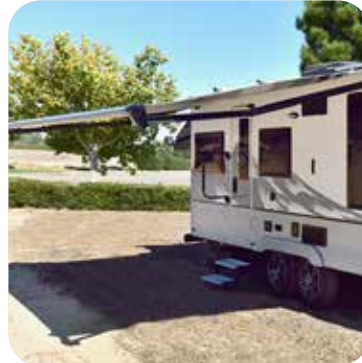
Latitude Awning with a Wind Sensor. Lateral arms eliminate head-knocking horizontal supports and enable the addition of more windows.