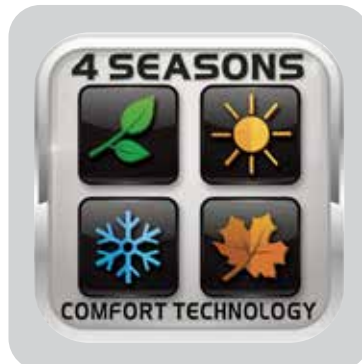
Four Season Package includes advanced insulation, dual-pane windows, heated floors, and enclosed, insulated tanks.