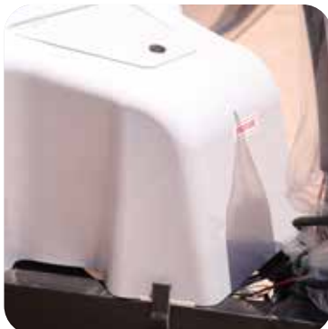
Tri-Five Propane Tank. Store three 5-gallon (20-pound) tanks under a stylish and aerodynamic cover.