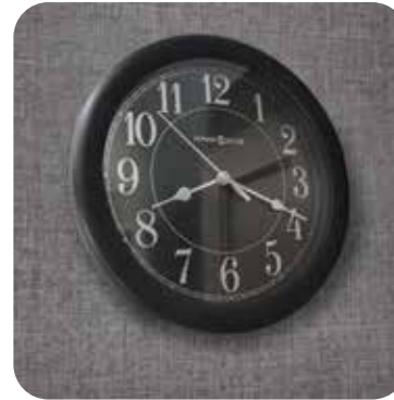
Wall Clock. A nod to an easier time. Something about an analog clock just makes you feel at home.