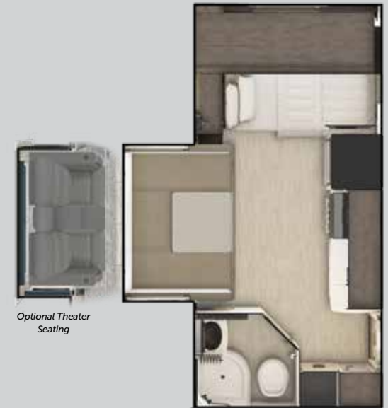
Optional Theater Seating