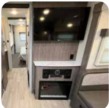
Electric Fireplace. Enjoy warmth and safe operation with this ambience setting feature.