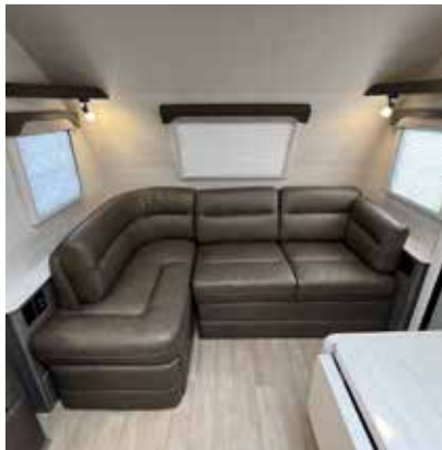
2465 J Lounge