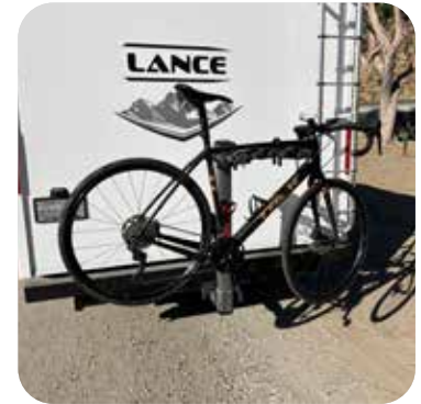
2" Utility Receiver. Standard receiver hitch for bike or storage racks. Limit 300 lbs. capacity.