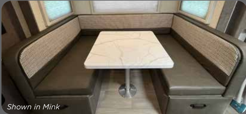
Shown in Mink