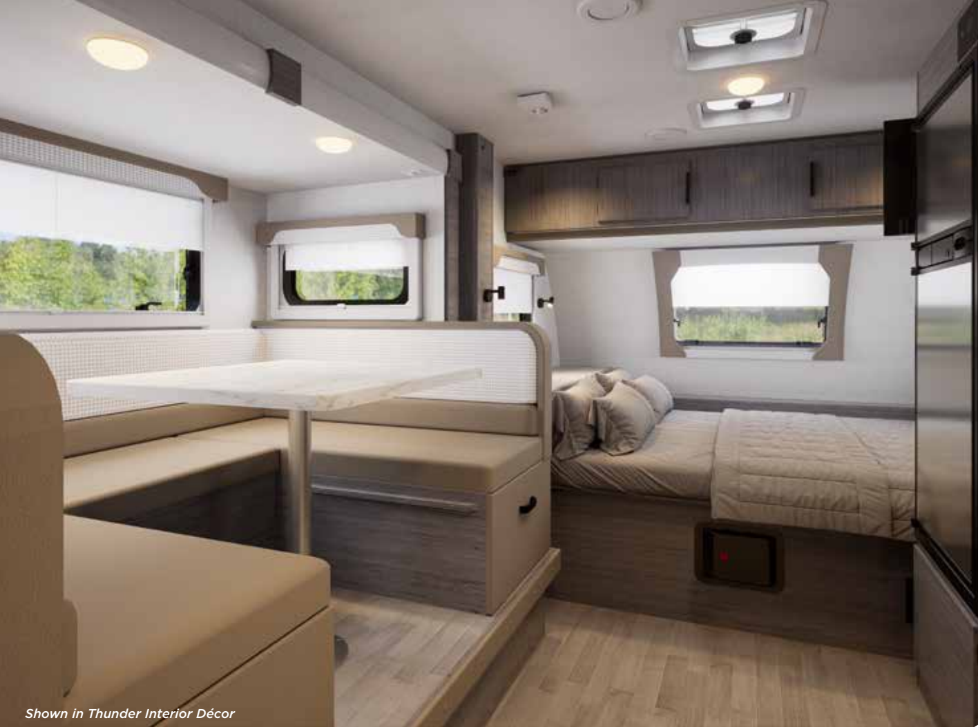
Shown in Thunder Interior Décor