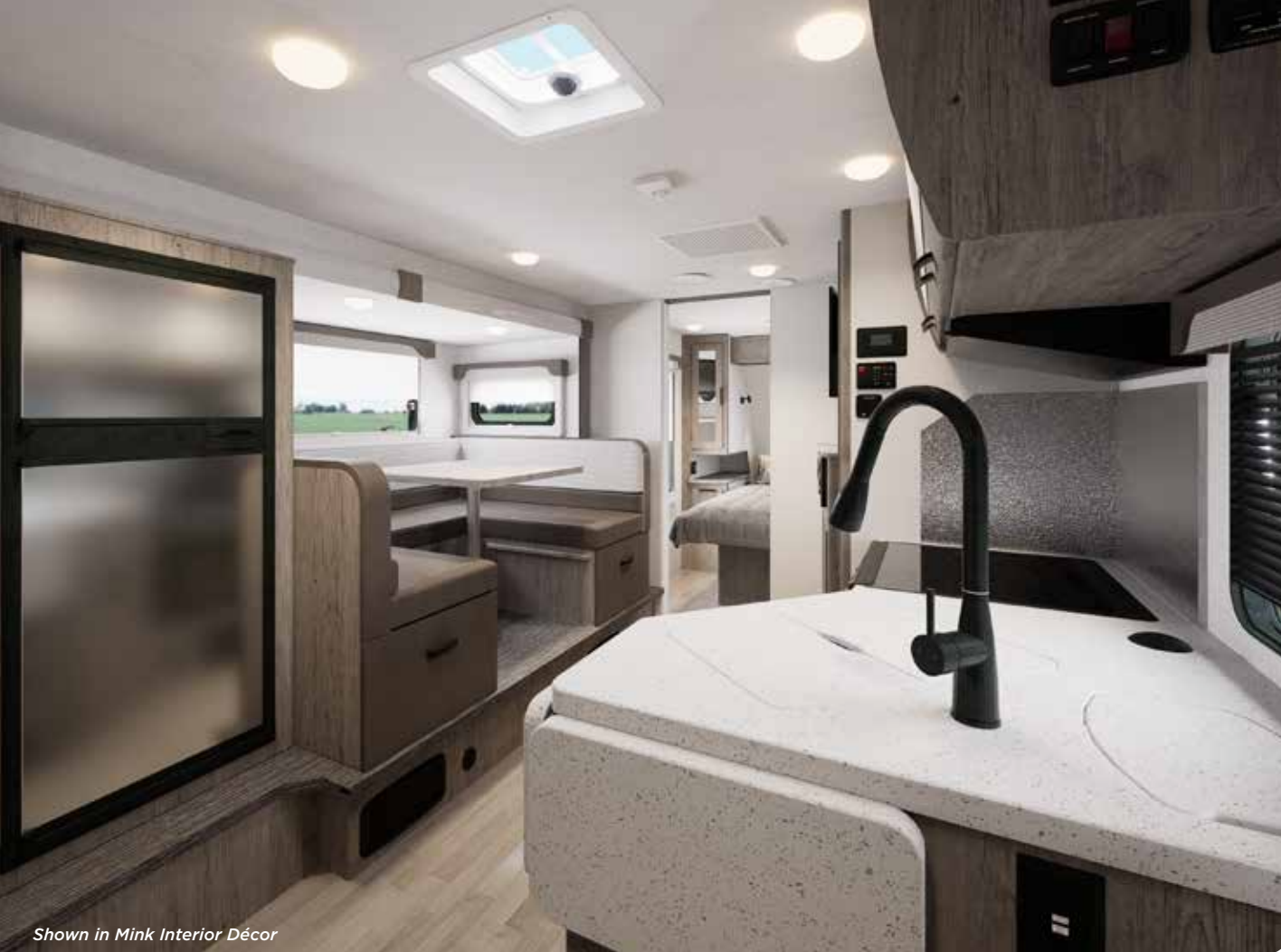
Shown in Mink Interior Décor