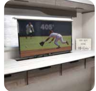
Smart TV. Stream your favorite apps from the comfort of your RV.