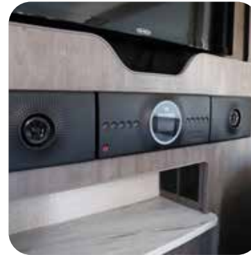
JBL AM/FM Stereo W/Powered Bass Subwoofer & Bluetooth Speaker. Premier sound inside the unit and on the go.