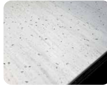
Beautiful and durable white quartz solid surface countertops.

Attention to Detail: We meticulously craft every detail, from sleek cabinetry to ergonomic furniture, to enhance your travel experience.