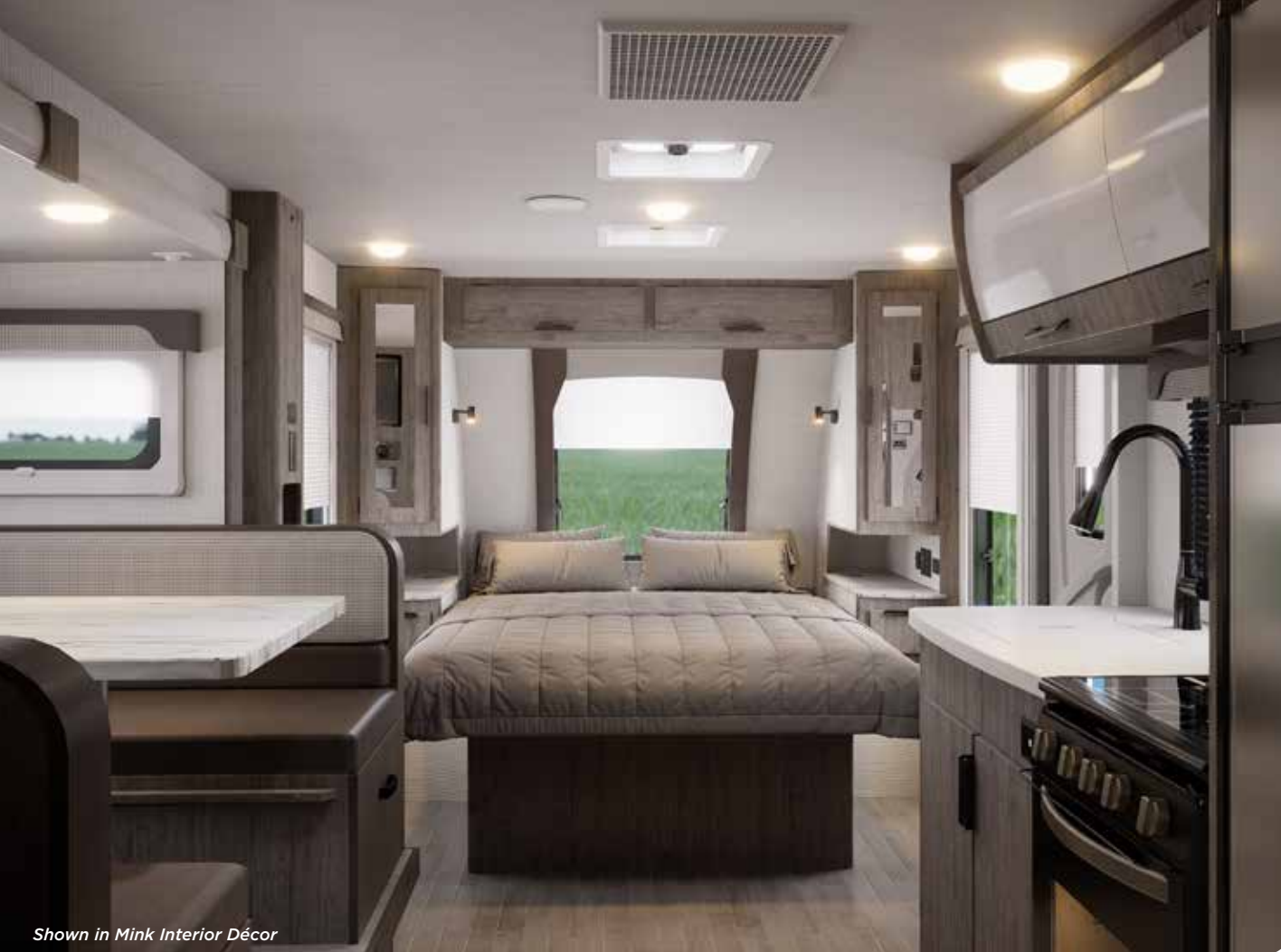
Shown in Mink Interior Décor