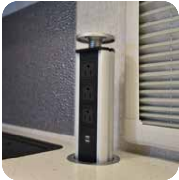
Pop-Up Electrical/Charging Tower. Easy access to outlets in the galley for extra appliances.