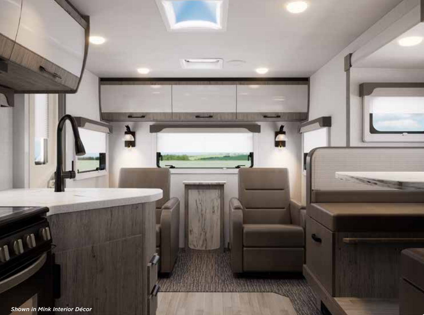
Shown in Mink Interior Décor