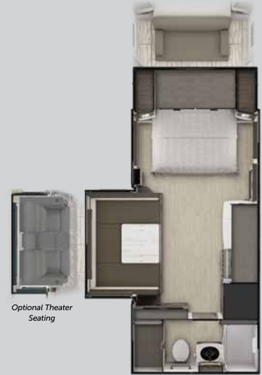
Optional Theater Seating