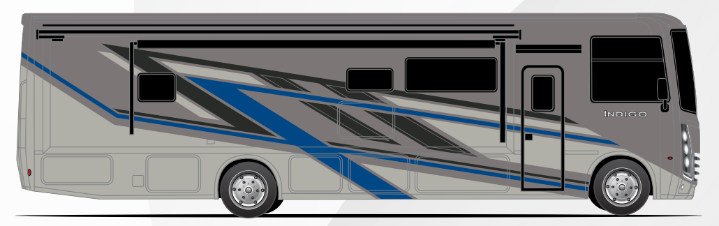
BLUE SHALE FULL BODY PAINT

Use your phone's camera to find out more information. Just scan the code!