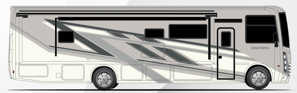
CRESTED WAVE FULL BODY PAINT