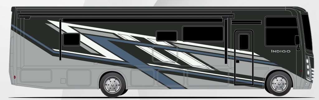
MOUNTAIN RIVER FULL BODY PAINT