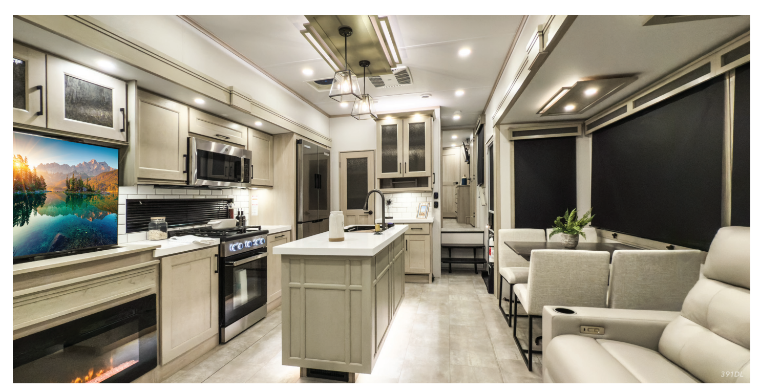
Because of our commitment to continuous product improvement, Grand Design Recreational Vehicles reserves the right to change components, standards, options, specifications, and materials without notice and at any time. Photos may show optional equipment which may not be included in the standard purchase price of the featured unit. Be sure to review current product details with your local dealer before purchasing.