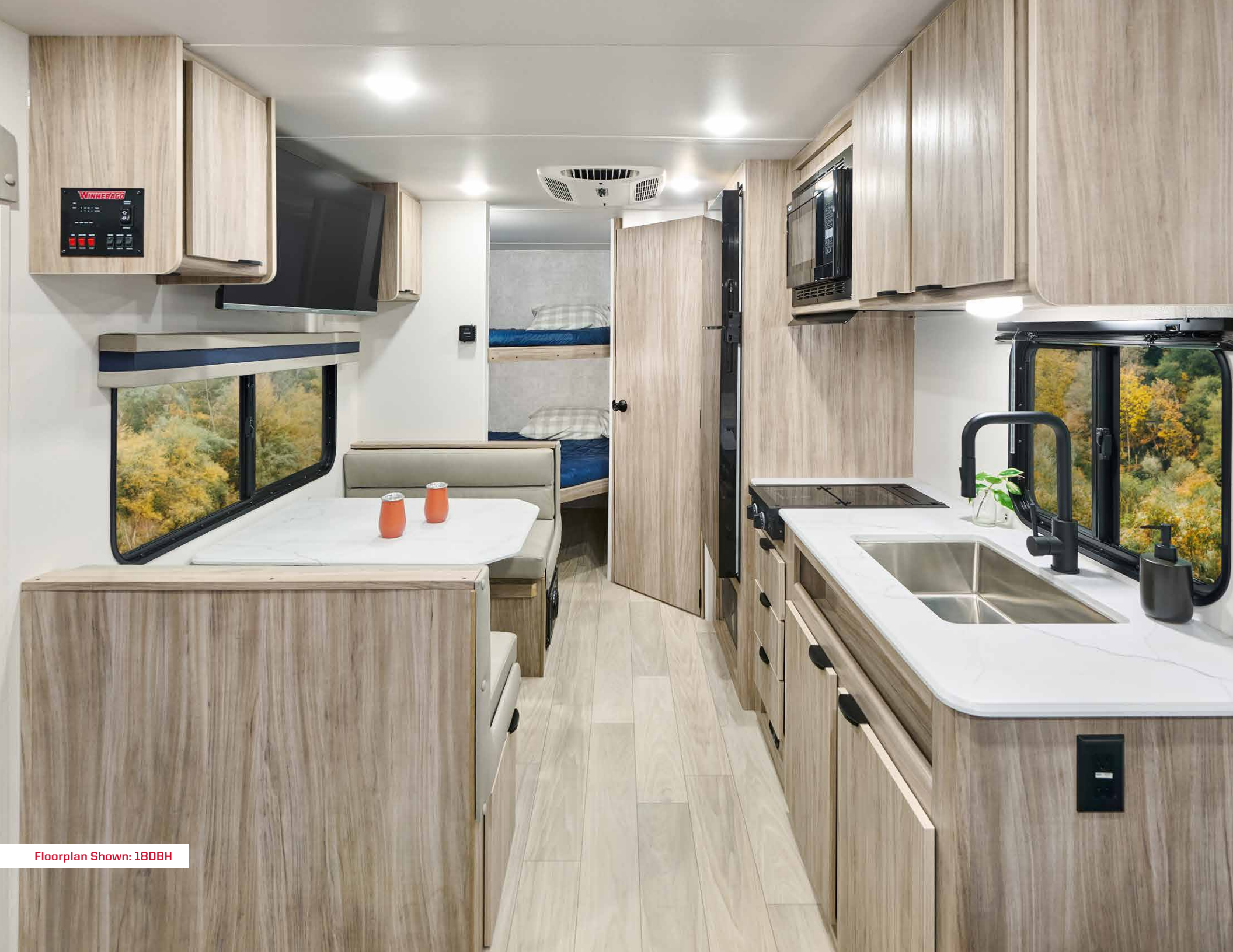
Floorplan Shown: 18DBH

The Winnebago Access offers nine distinct floorplan options, allowing you to choose the layout that suits your needs, including options for a bunkroom (15BH, 18DBH, 26BH, 30BH). Whether traveling with family or friends, the Access ensures everyone has a comfortable place to rest, along with intelligently designed underbed storage to maximize your space.