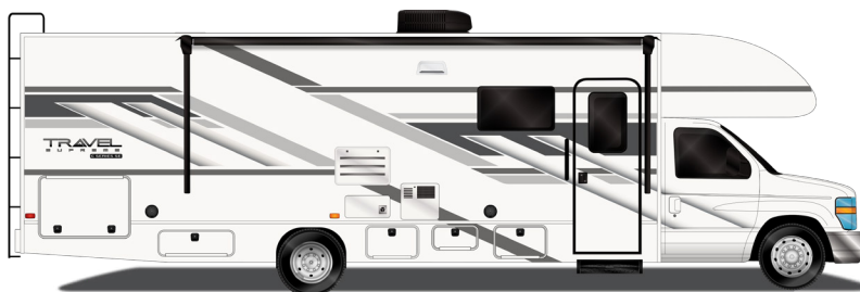
Standard Graphics Package