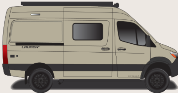
Standard Sandstone Van