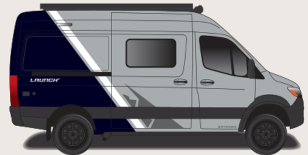
Mystic Tide Partial Paint (Blue-Grey Van Only)