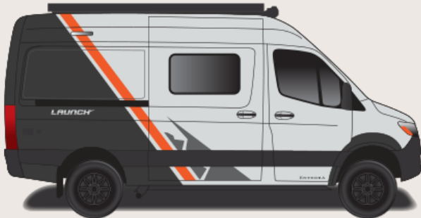
Aztec Partial Paint (Silver Van Only)