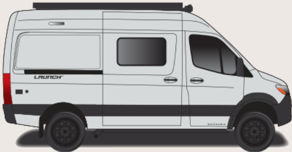
Standard Silver Van