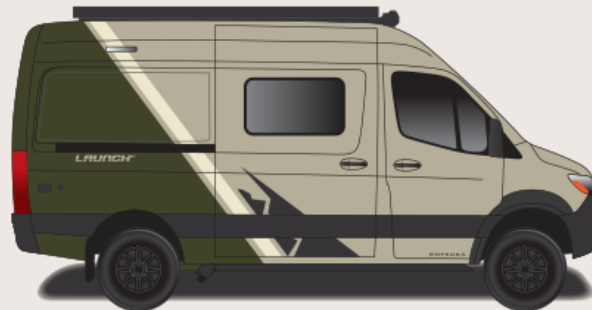
Forest Glade Partial Paint (Sandstone Van Only)