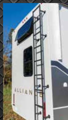
Oversized aluminum ladder