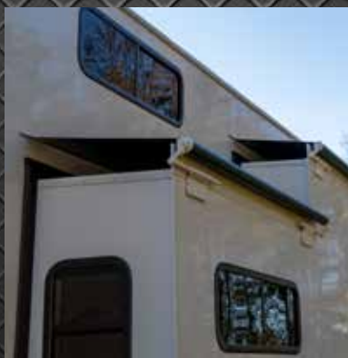
Slide topper awnings