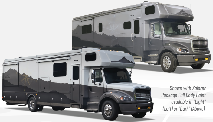
Shown with Xplorer Package Full Body Paint available in "Light" (Left) or "Dark" (Above).

Tested and developed for over a decade in the Canadian Rockies