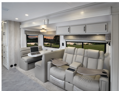
DynaQuest XL 37RB with Gray Mist Cabinetry and Milano décor is shown with Optional Power Theater Seats.