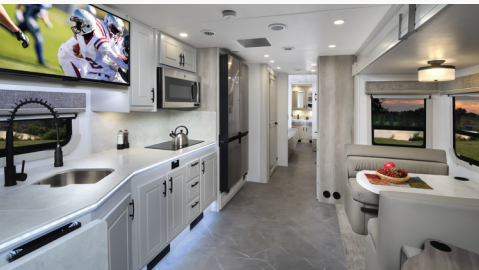
DynaQuest XL 37RB with Gray Mist Cabinetry and Milano décor.