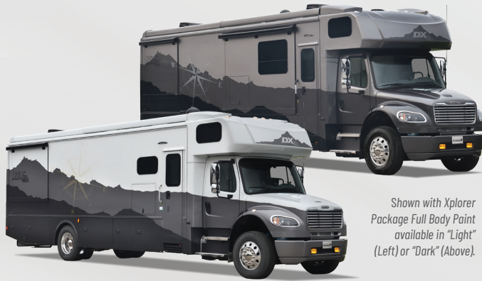
Shown with Xplorer Package Full Body Paint available in "Light" (Left) or "Dark" (Above).

Tested and developed for over a decade in the Canadian Rockies