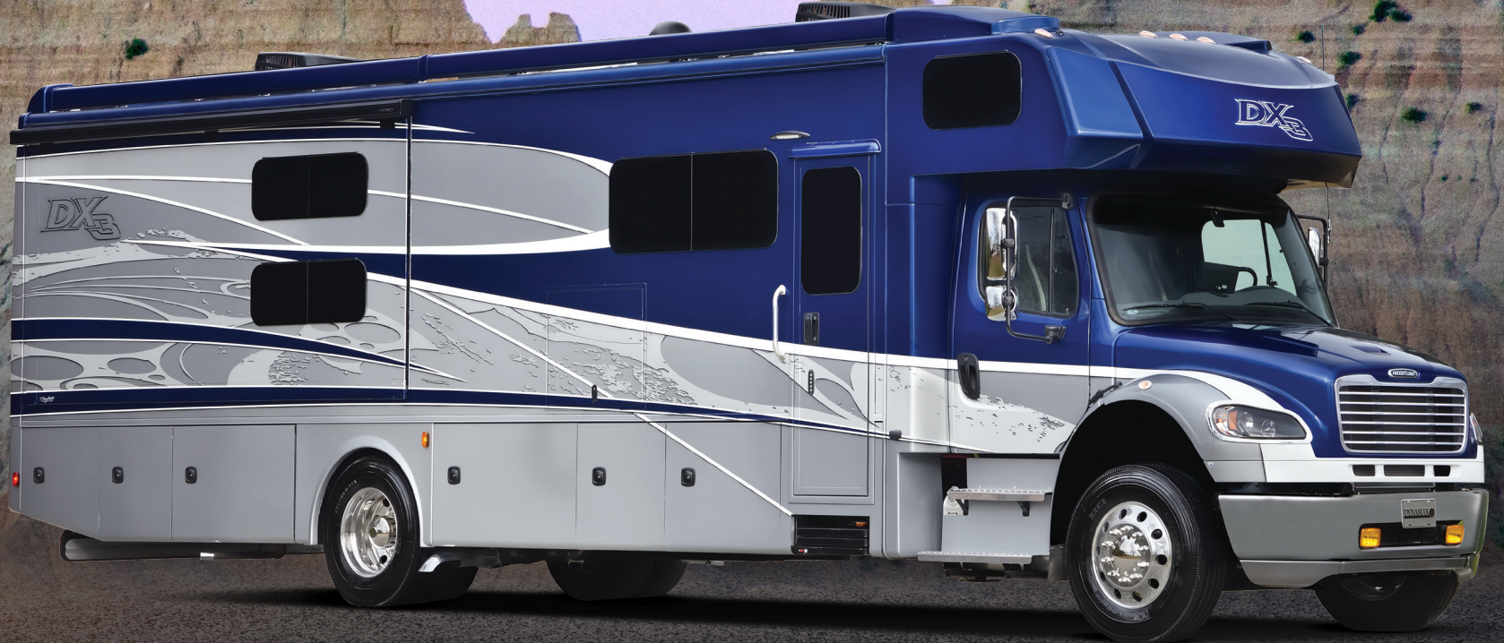
Pictured with Optional Extended Front Cap with Cab-Over Bunk