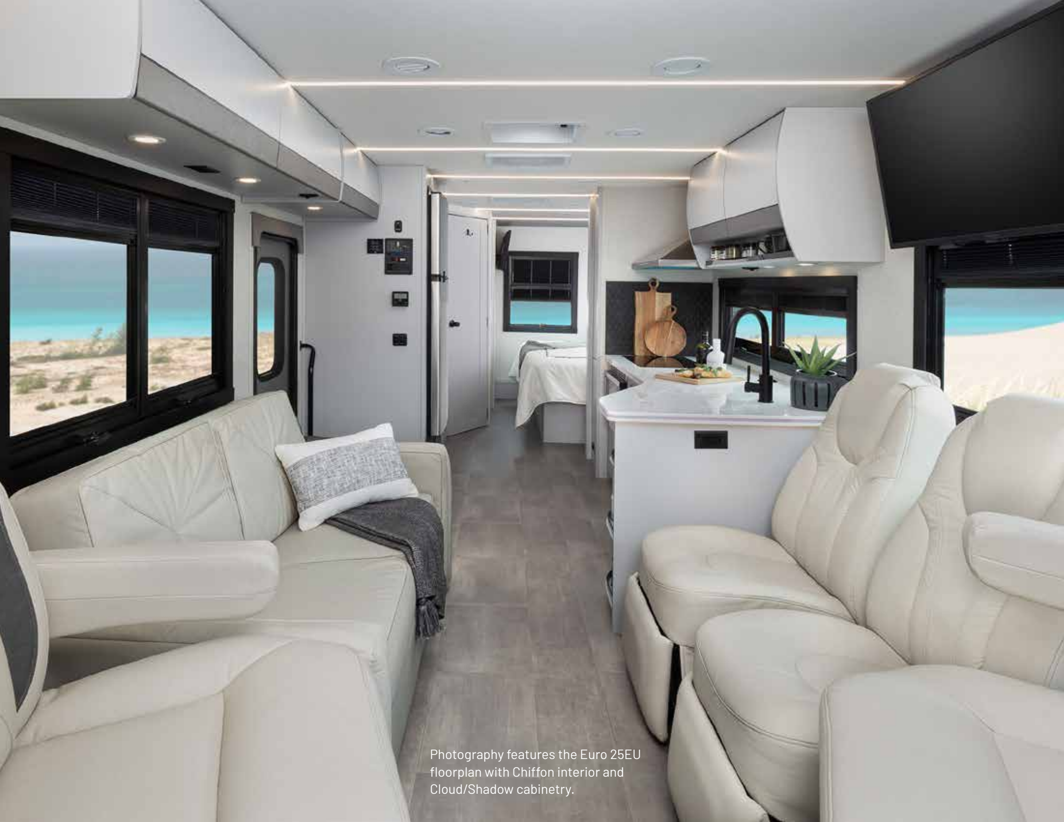
Photography features the Euro 25EU floorplan with Chiffon interior and Cloud/Shadow cabinetry.