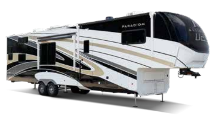
Full Body Paint Option Gold