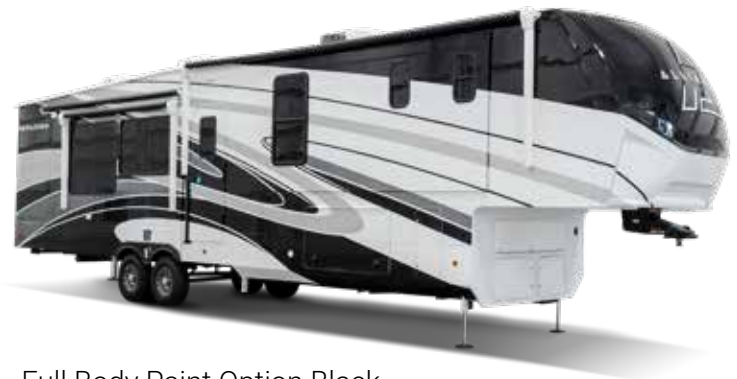
Full Body Paint Option Black