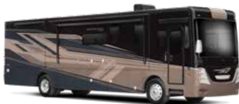
Full Body Paint - Draper