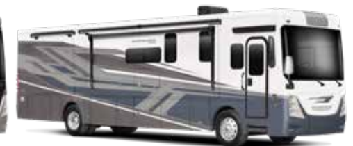
Full Body Paint - The Cooper