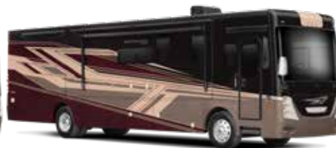
Full Body Paint - Madison Avenue