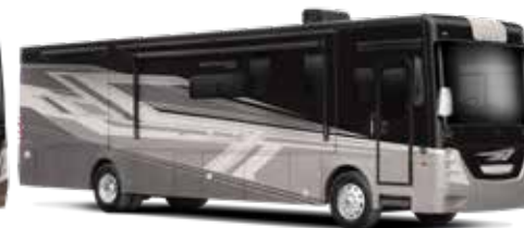
Full Body Paint - Sterling