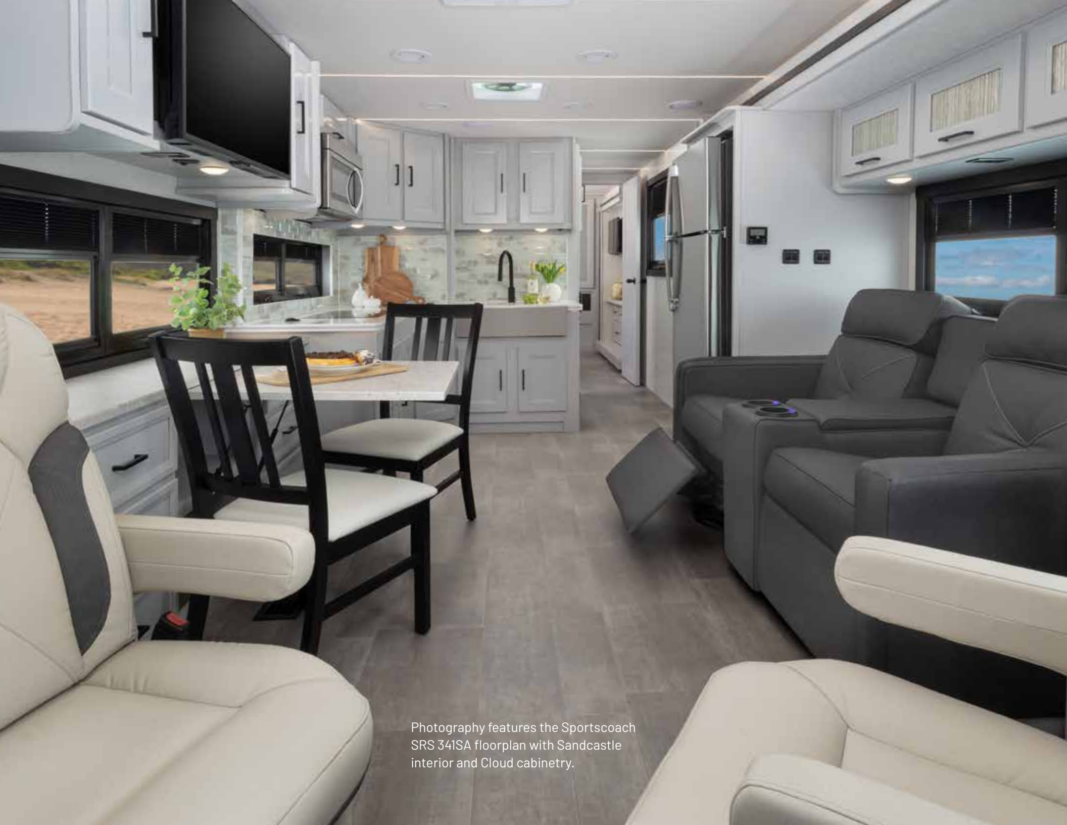
Photography features the Sportscoach SRS 341SA floorplan with Sandcastle interior and Cloud cabinetry.