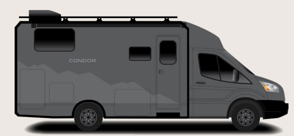
Magnet Full-Body Paint