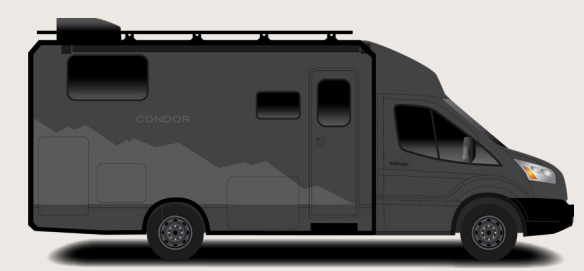
Black Hills Full-Body Paint