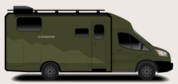
Conifer Full-Body Paint