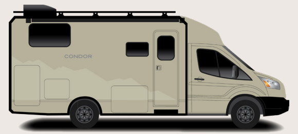
Sandy Oak Full-Body Paint