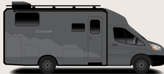
Magnet Full-Body Paint