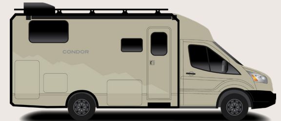
Sandy Oak Full-Body Paint