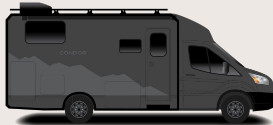
Black Hills Full-Body Paint