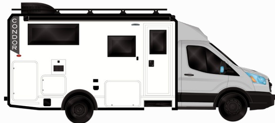
Graphics Delete Option