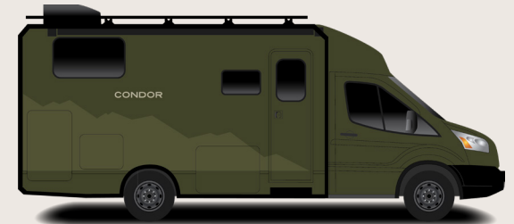
Conifer Full-Body Paint