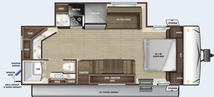
225CK A OPTIONS