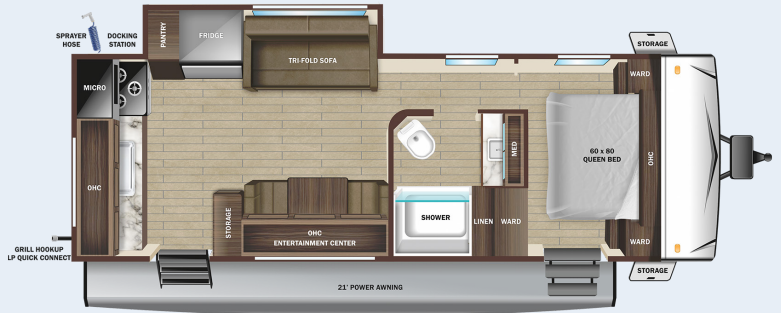
233ML A, B & C OPTIONS