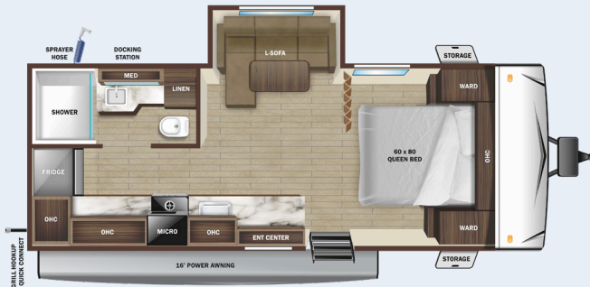
189RG A OPTION