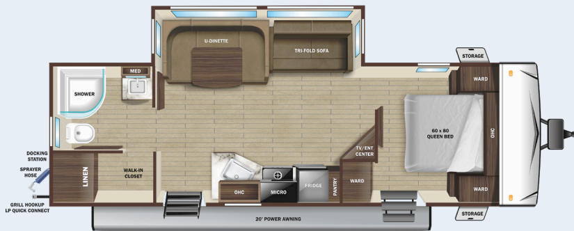
252RB A, B & C OPTIONS