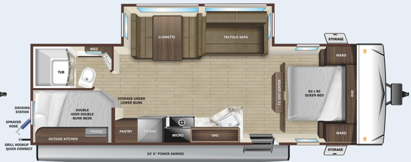
261BH A, B & C OPTIONS