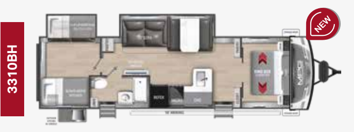
Length - 37´11 | Height - 11´6" | Cargo - 2,154 lbs Dry - 7,802 lbs | GVWR - 9,988 lbs | Sleeps - 9+