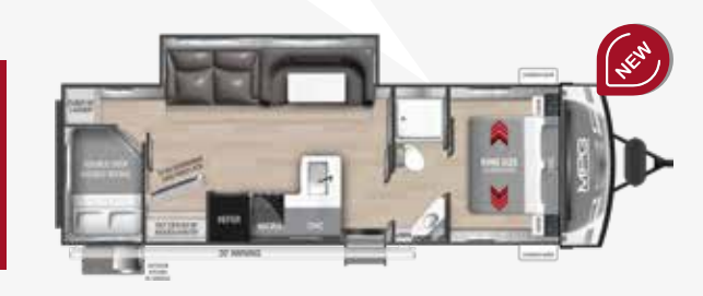
Length - 33´11" | Height - 11´6" | Cargo - TBD lbs Dry - TBD lbs | GVWR - TBD lbs | Sleeps - 9+