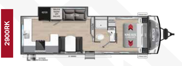
Length - 31´11" | Height - 11´3" | Cargo - 3,000 lbs Dry - 6,548 lbs | GVWR - 9,580 lbs | Sleeps - 5-6