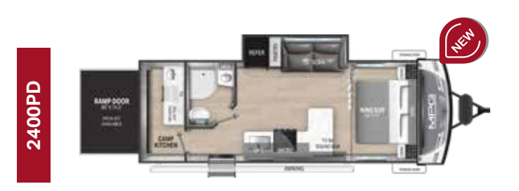
Length - 29´9 ¼″ | Height - 11´3″ | Cargo - 1,550 lbs Dry - 6,214 lbs | GVWR - 7,796 lbs | Sleeps - 3-4