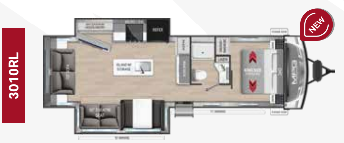
Length - 34´11" | Height - 11´6" | Cargo - 2,316 lbs Dry - 7,566 lbs | GVWR - 9,914 lbs | Sleeps - 5-6