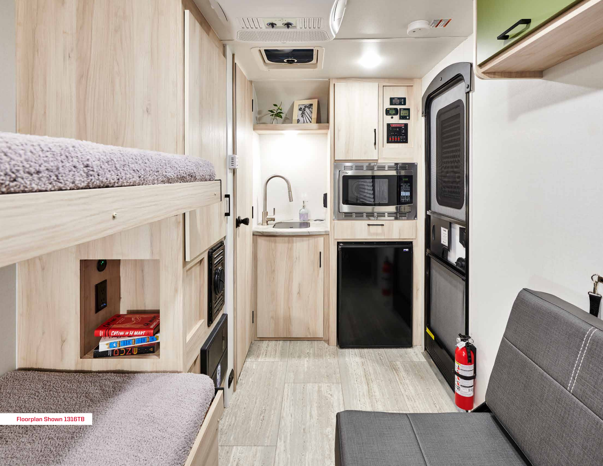
Floorplan Shown 1316TB