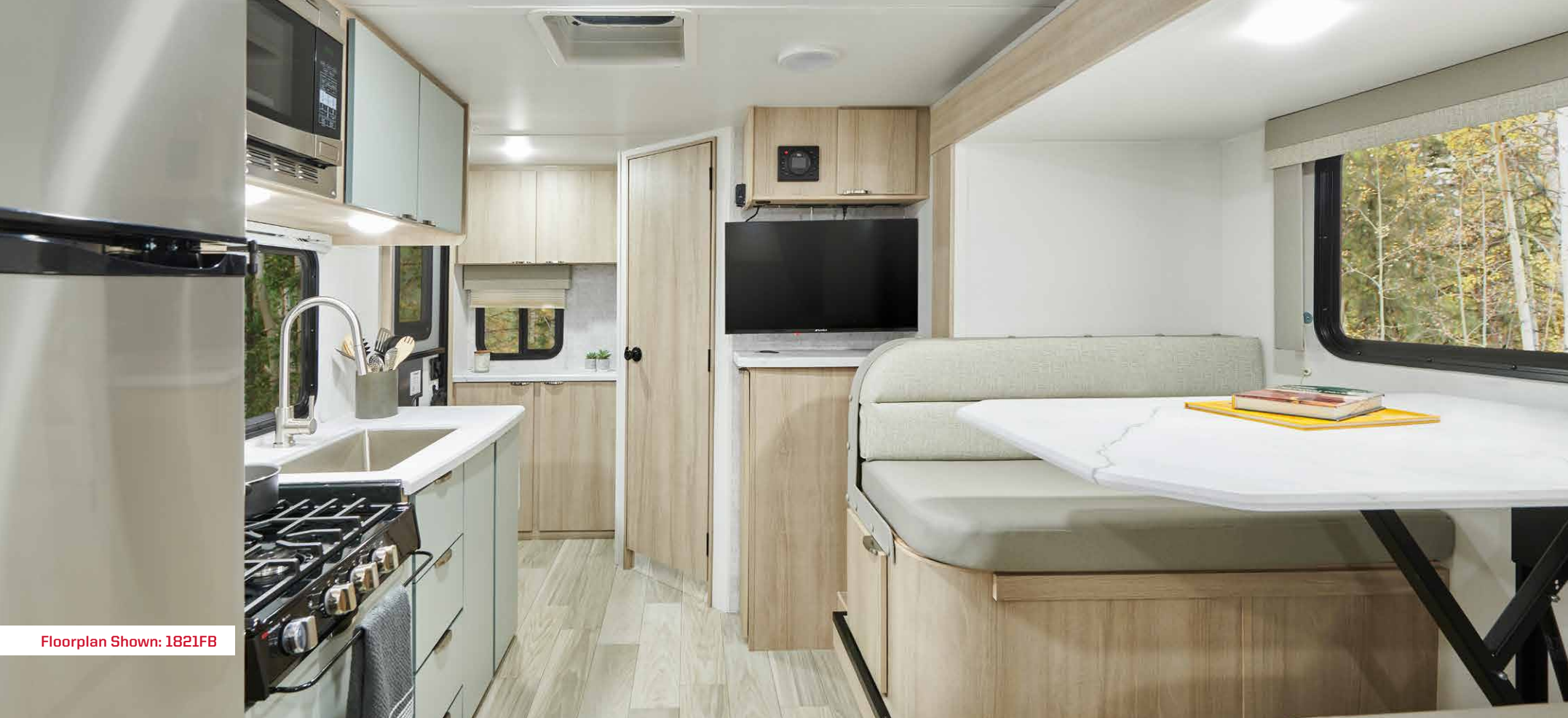
Floorplan Shown: 1821FB