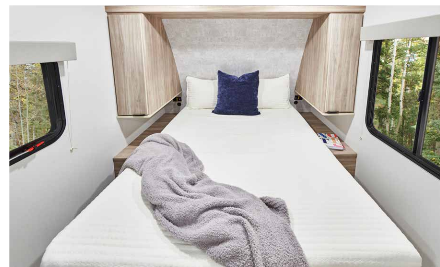
Floorplan Shown 2326RK