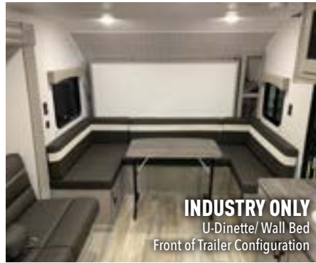
INDUSTRY ONLY U-Dinette/ Wall Bed Front of Trailer Configuration