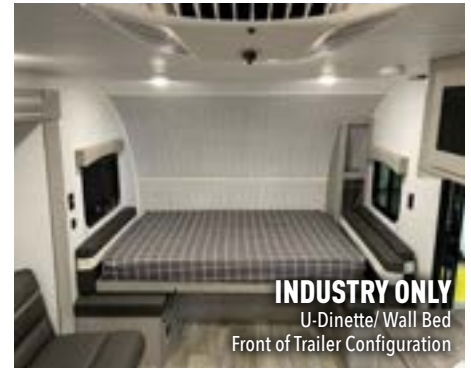
INDUSTRY ONLY U-Dinette/ Wall Bed Front of Trailer Configuration