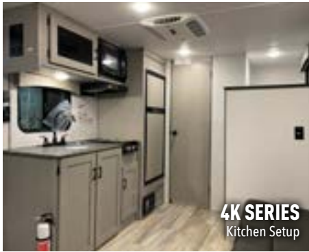
4K SERIES Kitchen Setup