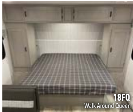
18FQ Walk Around Queen