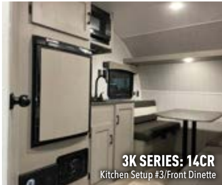
3K SERIES: 14CR Kitchen Setup #3/Front Dinette