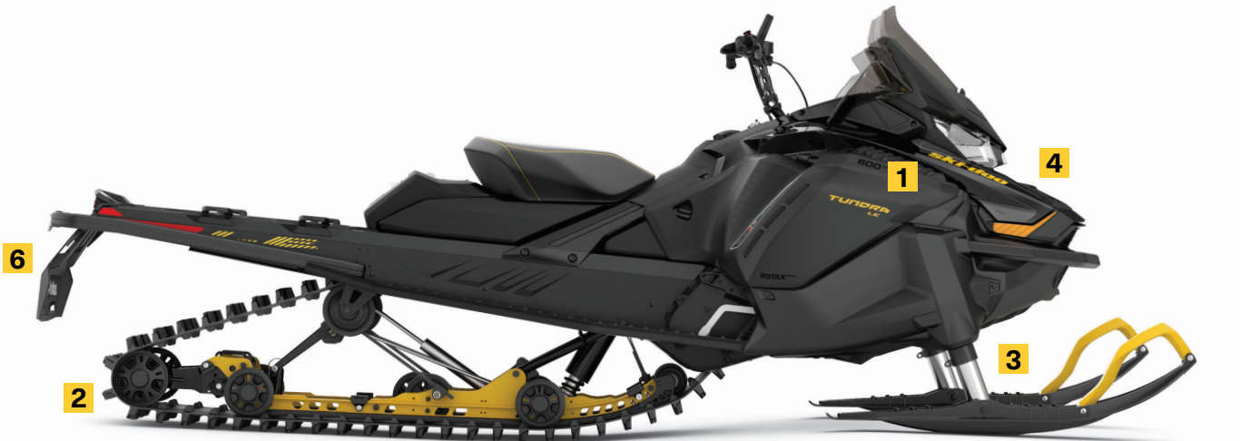
TUNDRA LE 600 EFI SHOWN

Industry-exclusive telescopic front suspension enables a large, flat belly pan for exceptional deep snow flotation.