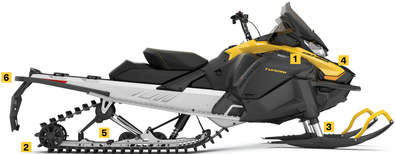
TUNDRA SPORT 600 EFI SHOWN

Industry-exclusive telescopic front suspension enables a large, flat belly pan for exceptional deep snow flotation.