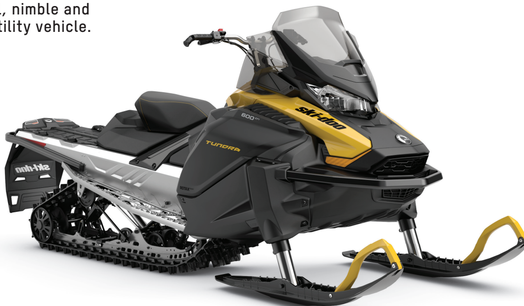
TUNDRA SPORT 600 EFI SHOWN

Economical, nimble and fun light-utility vehicle.