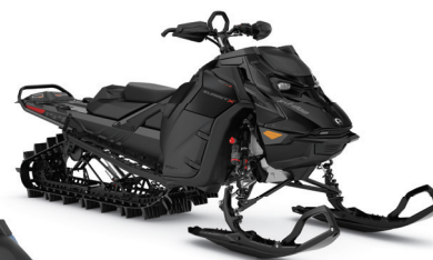
SUMMIT X WITH EXPERT PACKAGE 154 850 E-TEC TURBO R SHOWN

The ultimate precise and predictable deep-snow sled with features sharpened for most technical terrains.