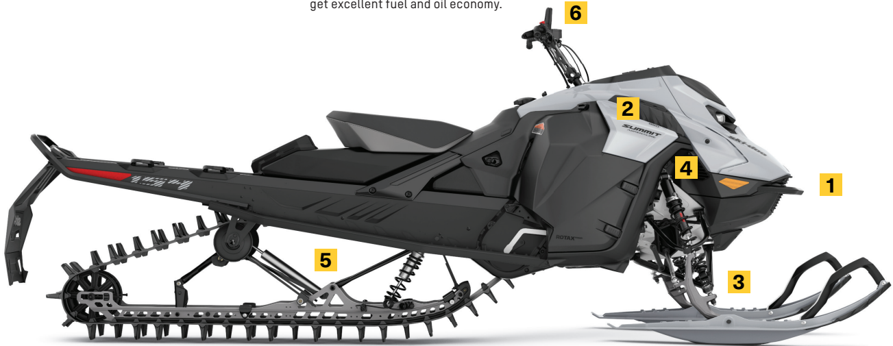
SUMMIT ADRENALINE 154 850 E-TEC SHOWN

Lightweight alloy spindle with revised geometry and new ski stopper to reduce ski drag for more predictable handling and a confidence-inspiring ride in technical sidehills and rough terrain.