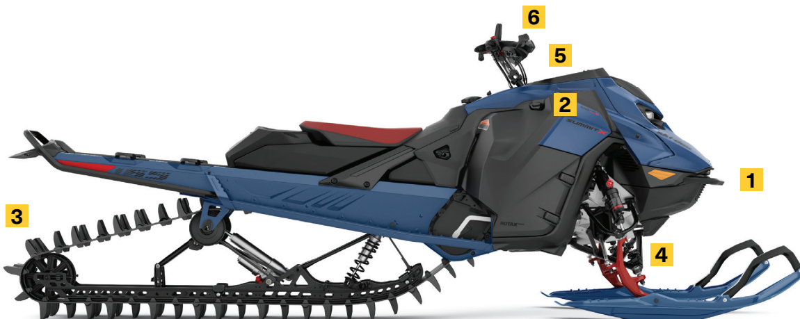
SUMMIT X WITH EXPERT PACKAGE 165 850 E-TEC TURBO R SHOWN

This lighter, redesigned 16-in. track unique to the Expert package, has a stiffer edge that compliments the fixed rear arm of the tMotion XT for more rigidity in the rear skid.