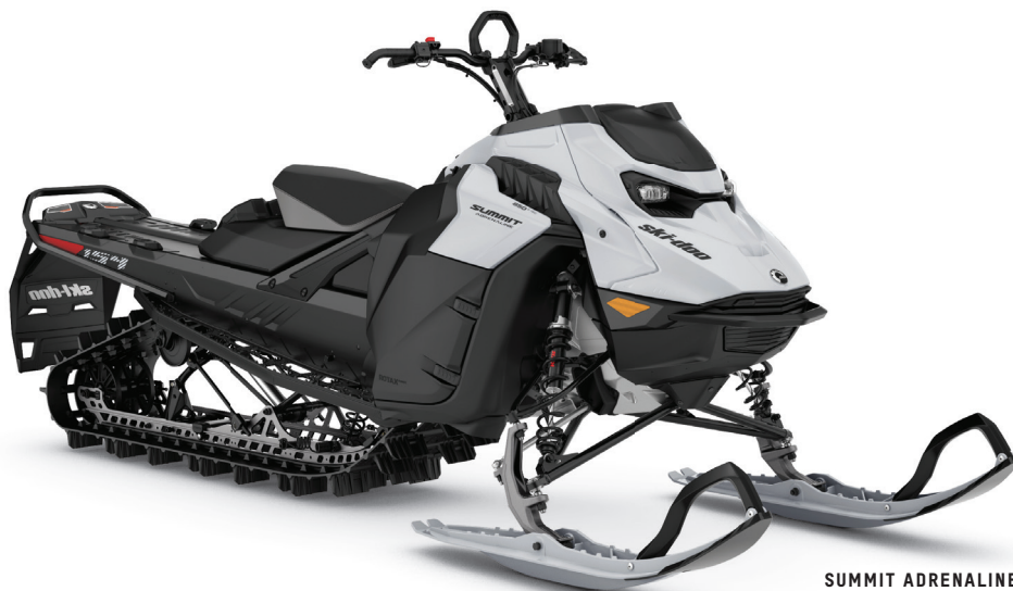
SUMMIT ADRENALINE 154 850 E-TEC SHOWN

An excellent deep snow machine for any rider.