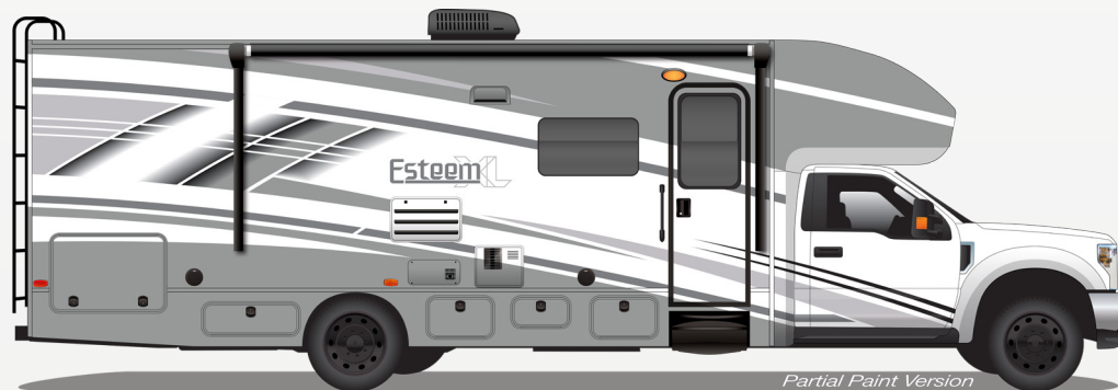
Standard Partial Paint