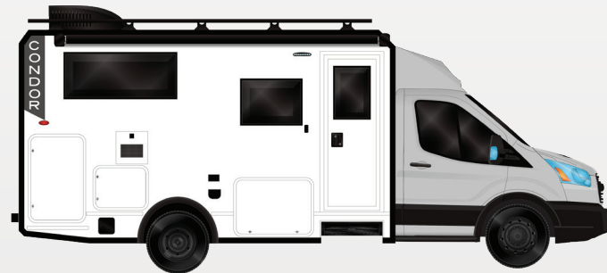
Graphics Delete Option