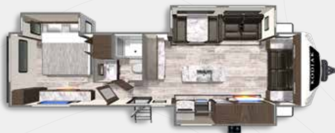
KODIAK ULTIMATE 3371FLSL Length: 37' 3" Weight: 7,564 lbs. Sleeps: 3-4 Hitch: 1,109 lbs. Height: 11' 2"