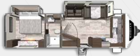
KODIAK ULTIMATE 2921FKDS Length: 33' 8" Weight: 6,554 lbs. Sleeps: 3-4 Hitch: 782 lbs. Height: 11' 1"

*All information & specifications are for units manufactured after 10/01/2023