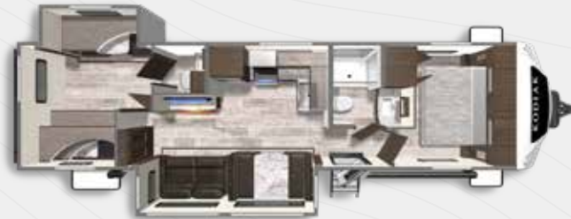
KODIAK ULTIMATE 3301BHSL Length: 37' 3" Weight: 7,195 lbs. Sleeps: 6-8 Hitch: 892 lbs. Height: 11' 2"