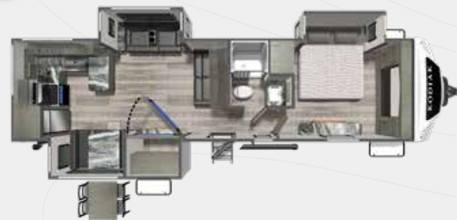
KODIAK ULTIMATE 3361RKSL Length: 37' 3" Weight: 7,885 lbs. Sleeps: 2-4 Hitch: 1,125 lbs. Height: 11' 4"