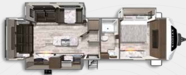
KODIAK ULTIMATE 3221RLSL Length: 36' 11" Weight: 7,623 lbs. Sleeps: 4-6 Hitch: 1,051 lbs. Height: 11' 2"