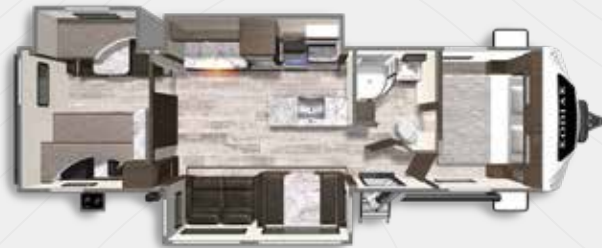
KODIAK ULTIMATE 3321BHSL Length: 37' 3" Weight: 7,555 lbs. Sleeps: 8-10 Hitch: 917 lbs. Height: 11' 2"