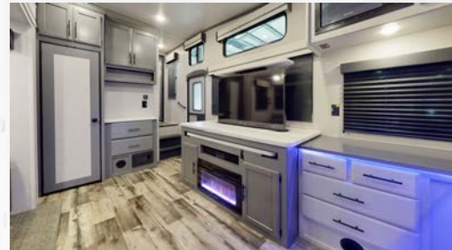
269RK Back to Front