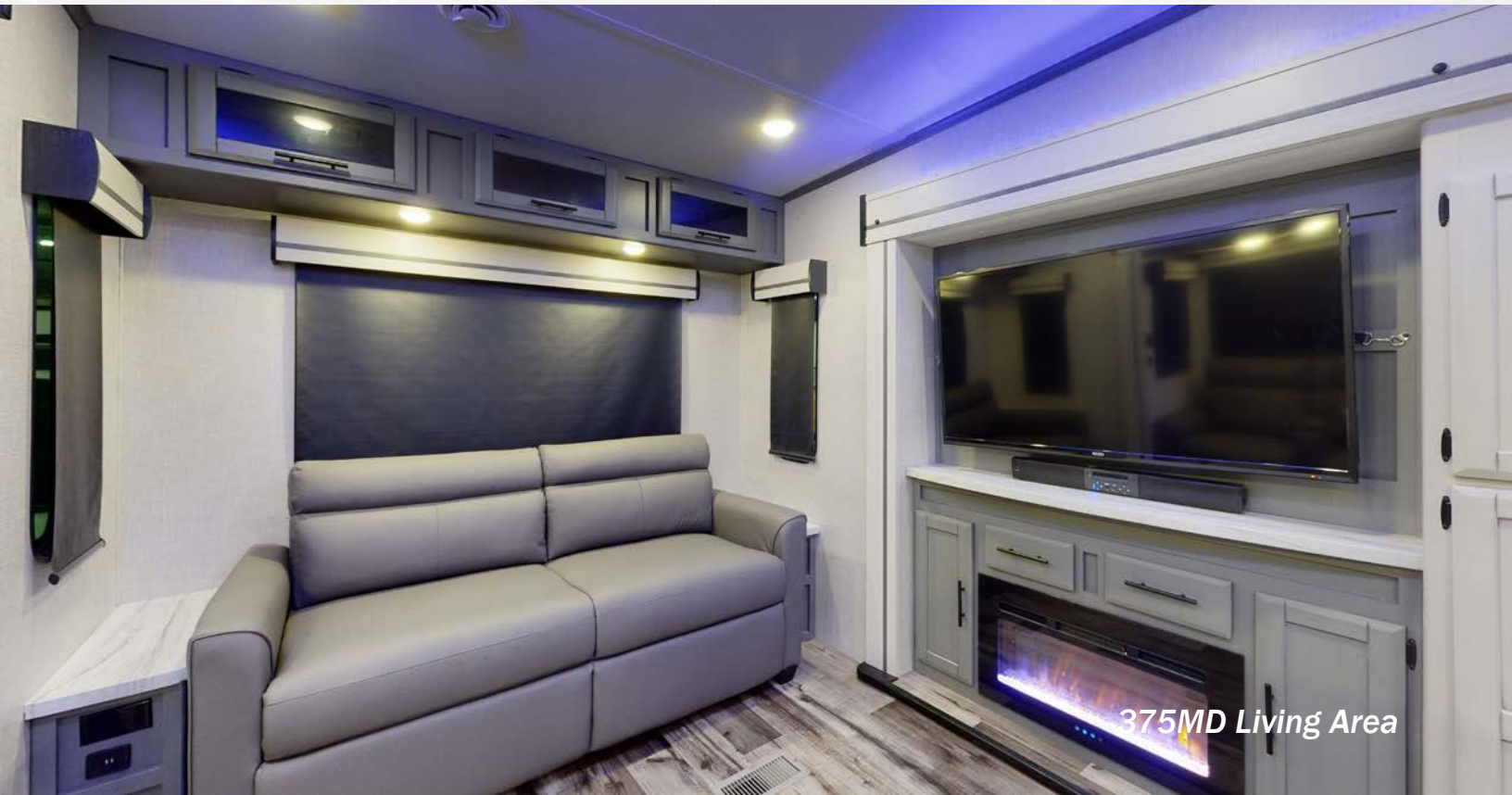
375MD Living Area