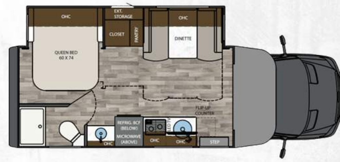
25FWS | 25' FULL WALL SLIDE W/ CABOVER STORAGE