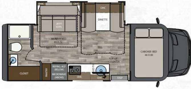
25RMC | 25' MURPHY BED W/ CABOVER BUNK