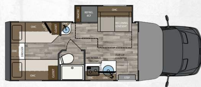
25TBN | 25' TWIN BEDS W/ CABOVER STORAGE