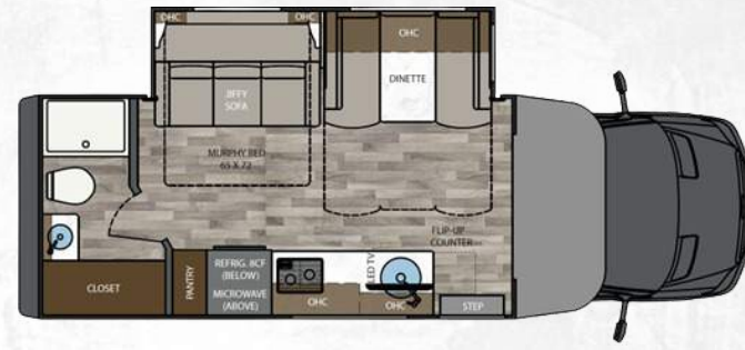
25RML | 25' MURPHY BED W/ CABOVER STORAGE