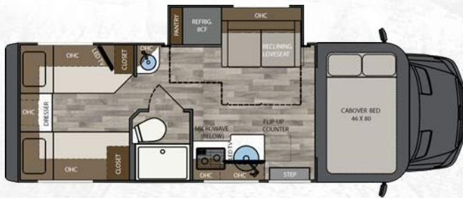
25TBC | 25' TWIN BEDS W/ CABOVER BUNK