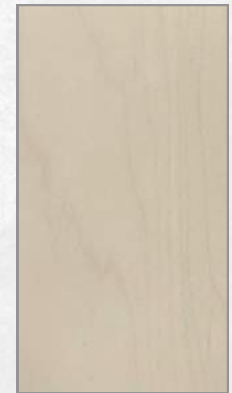
BURNISHED LAKWOOD CASHMERE SABLE