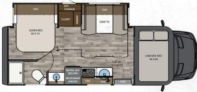
25FWC | 25' FULL WALL SLIDE W/ CABOVER BUNK