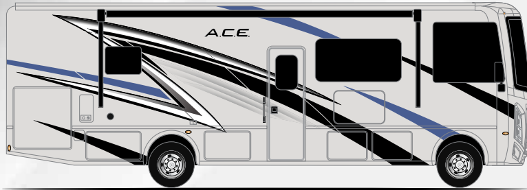
RIVER WALK II HD-MAX