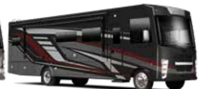
Full Body Paint - Urban Adventure