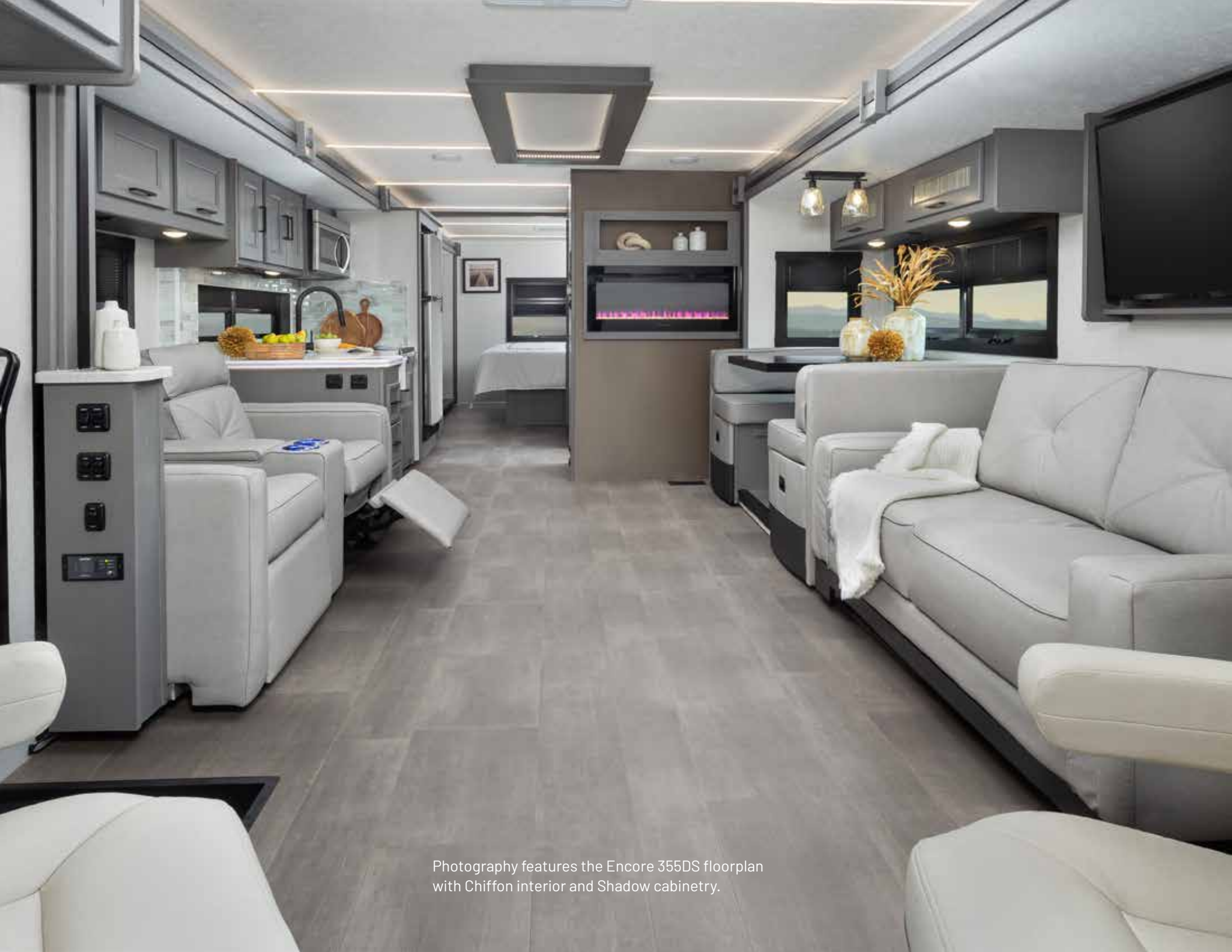
Photography features the Encore 355DS floorplan with Chiffon interior and Shadow cabinetry.