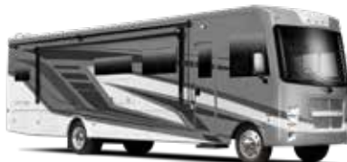
Full Body Paint - Arctic Frost