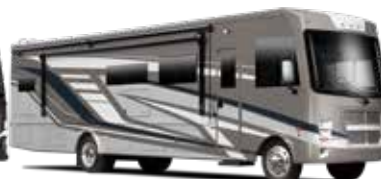
Full Body Paint - Oceanic Dreams