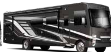
Full Body Paint - Midnight Sky