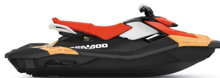
● NEW Sunrise Orange and Dragon Red