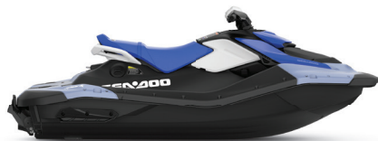
● NEW Dazzling Blue and Vapor Blue