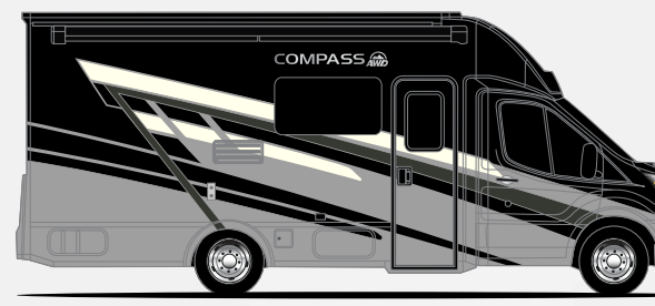
BRILLIANT CARBON FULL-BODY PAINT