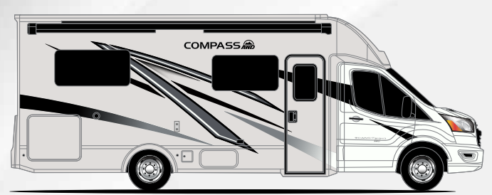
BLACK ICE MHD-MAX