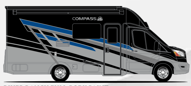
RIVER RANCH FULL-BODY PAINT