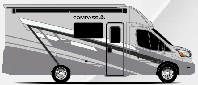
SEASHELL GREY FULL-BODY PAINT