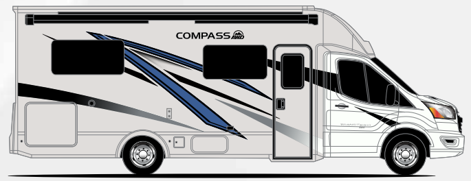
DRESS BLUE THD-MAX