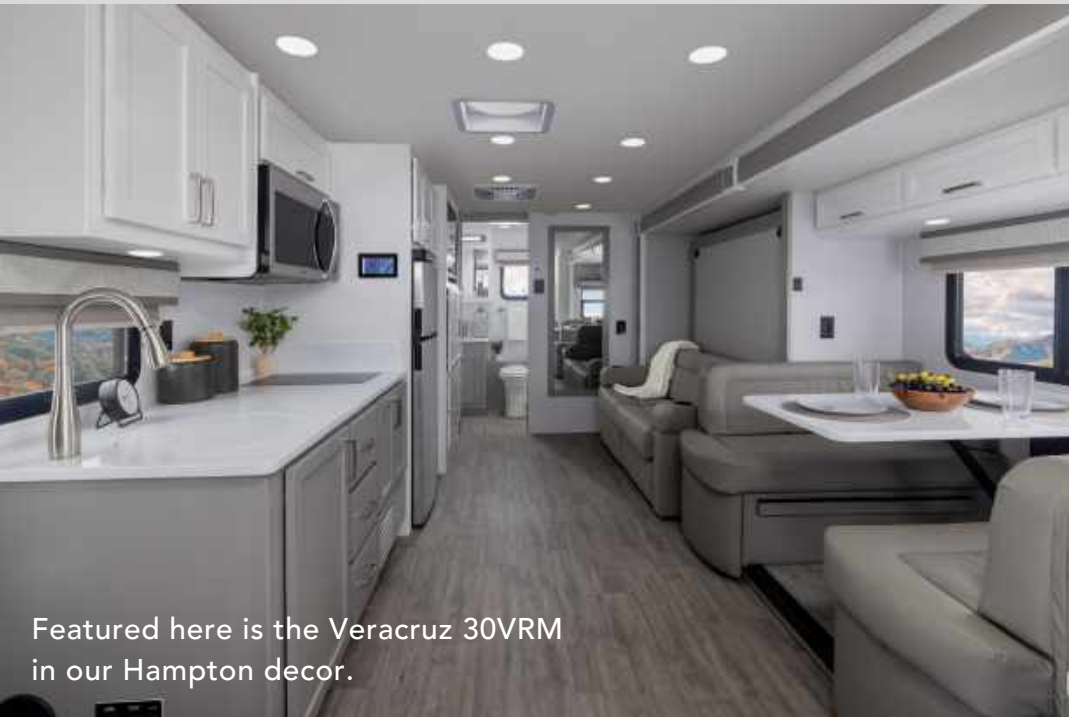
Featured here is the Veracruz 30VRM in our Hampton decor.