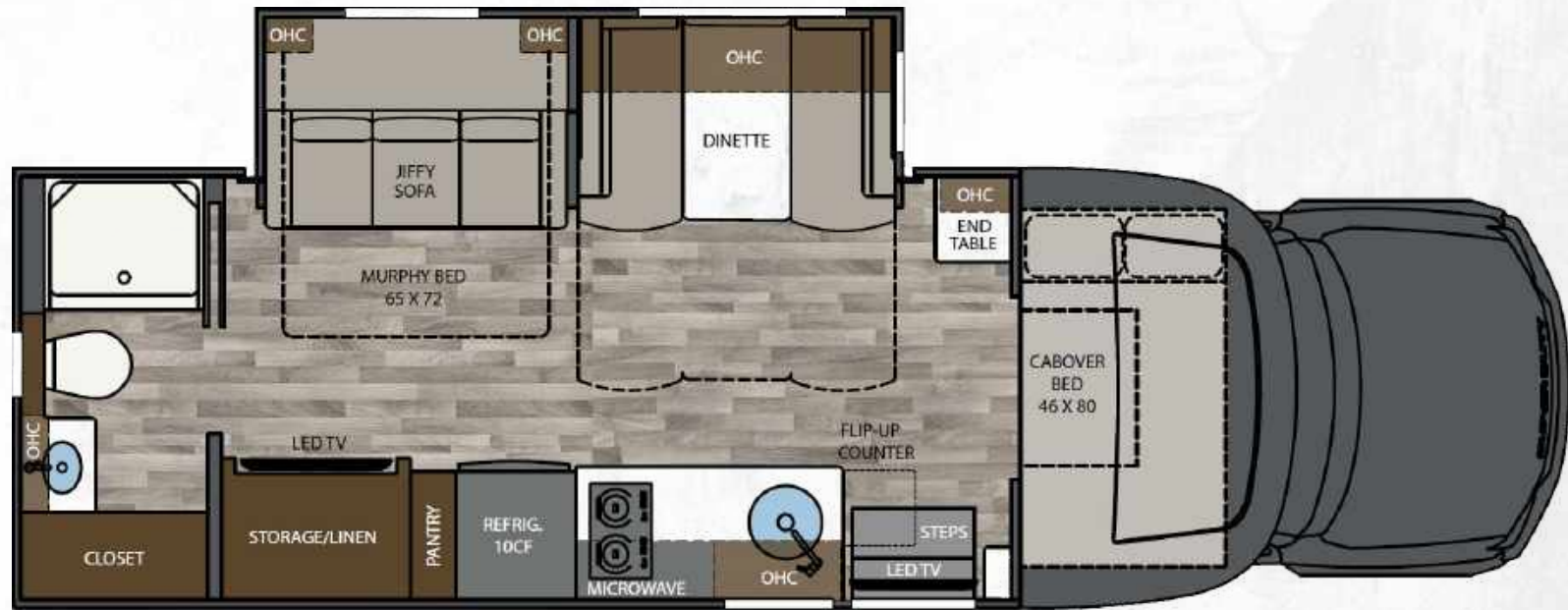
30VRM | 30' FRONT ENTRY, REAR MURPHY BED