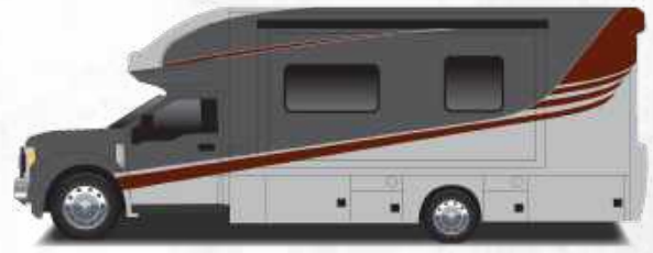
RED ROCK CANYON