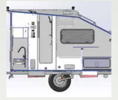
SolidWorks<sup>™</sup> 3D design software is the birthplace of every Lance RV. A team of Computer-aided design (CAD) engineers utilize this software to dictate down to the exact screw and wire locations. Taking the guess work out of production and maintenance.