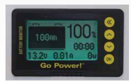
Battery Monitor -View your battery's performance and understand battery stats at the push of a button. Time left at Current Draw. State of Charge. Capacity. etc.