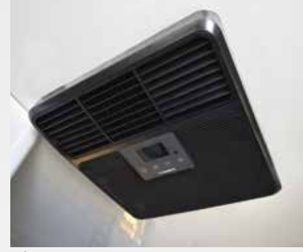
\ensuremath{\mathsf{A/C}} - 12Volt – Keeping you cool without needing to be plugged in.