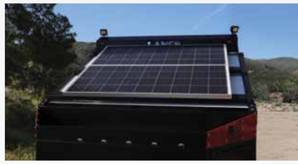
190 Watt Solar Panel & Solar on the Side Pre-Wire (SAE Port) - Achieve electrical independence by drawing power from the sun. Enduro features up to 2 panels & a receptacle for an additional external panel. *Second Panel Optional *External Panel Sold Separately

1500W Inverter & Lithium Battery (100AH) - Converts DC electricity from the RV battery into AC electricity. Giving you power to all outlets while off-grid. Lithium batteries discharges at 100 percent. Giving you double the capacity over a lead acid. More power in the same amount of space while being lighter weight and lasting longer. *Second Battery Optional