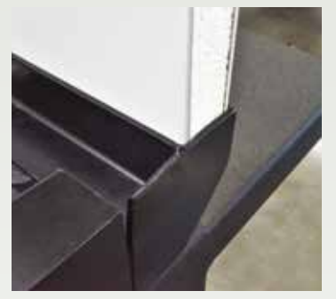
Enduro's Next Generation LanceLock™ Exoskeleton features a direct extrusion superstructure. The walls are slotted and held within an aluminum exoskeleton. This method eliminates weak fasteners and welds while improving load transfer- both armoring and attaching components for extreme use.