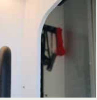
Computer Numerical Control (CNC) machines precision cut the majority of Enduro components. Laser guided cutting eliminates error, resulting in true 90-degree angles and a tight fit. Keeping your trailer together on the trail.