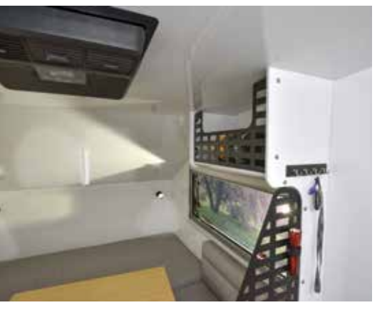
Euro-Ply™ cabinetry and interior walls are thick, lightweight and do not contain formaldehyde or "offgas" like many other RVs. No facia board or thin trim. Go ahead and give it a knock!