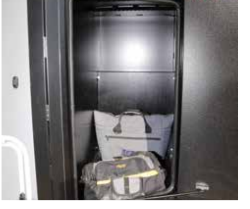
Aluminum exoskeleton and tongue mounted storage box with firewood rack are lightweight and become stronger as the temperature drops. Wheel wells, running boards/ rub rails and chassis made of high strength steel- sand blasted and powder coated to prevent rust.