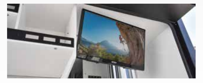
Smart TV & Portable JBL Bluetooth Speaker - Stream your favorites or rock out while at camp. A TV is especially nice when winding down or during inclement weather days. JBL brand speaker can be brought out to the fireside or on a hike.