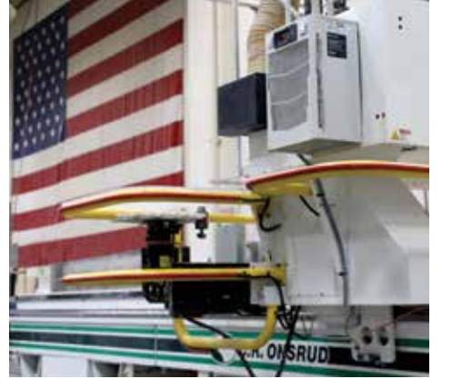
Full pressure pinch bonded walls, floor, and ceiling. Every exterior shell component is laminated using ultra high pressure. No trussing or dead space to allow heat/cold transfer or delamination.