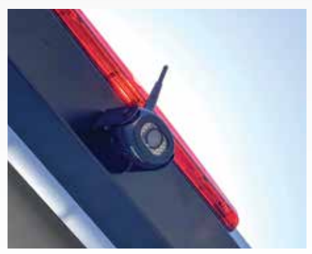
Wireless Rear Camera W/Color Display and Sound – Makes backing up effortless.