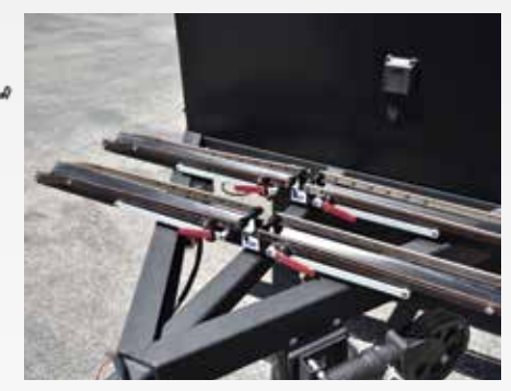
Bike Racks (2) W/ Frame Mounted Cable Lock & Key - Sturdy mounting and safe storage of your traditional or electric bicycle(s).