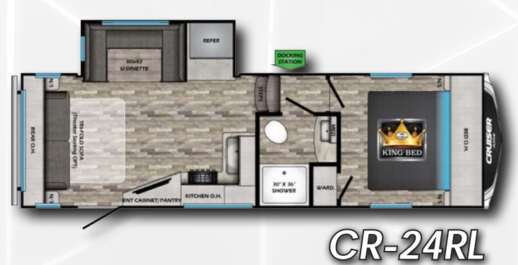
Turning Point Pin Box (90° Turning)