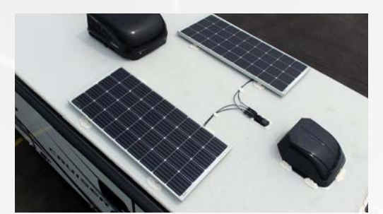
Solar Freedom 2