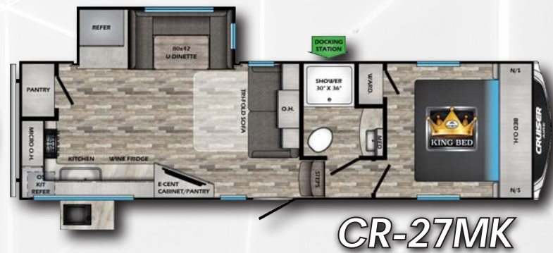
Turning Point Pin Box (90° Turning)