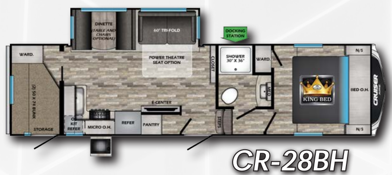
Turning Point Pin Box (90° Turning)