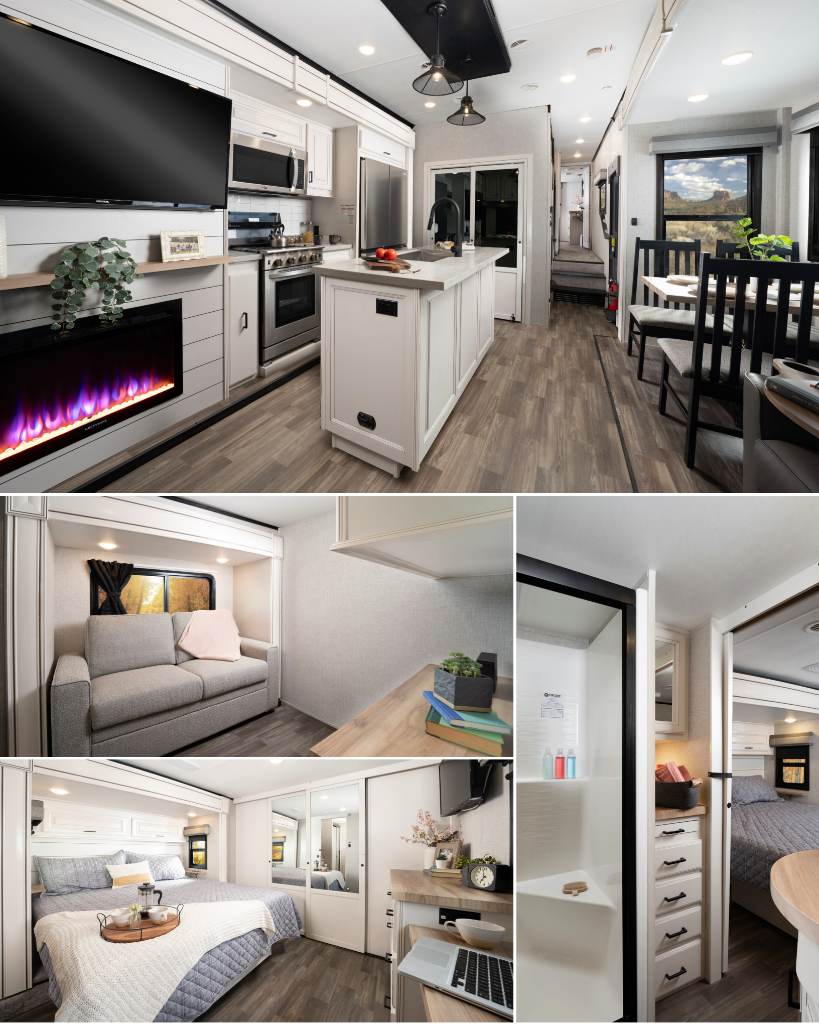
2024 Open Range 371MBH