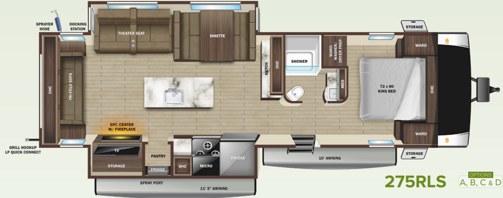
275RLS OPTIONS A, B, C & D