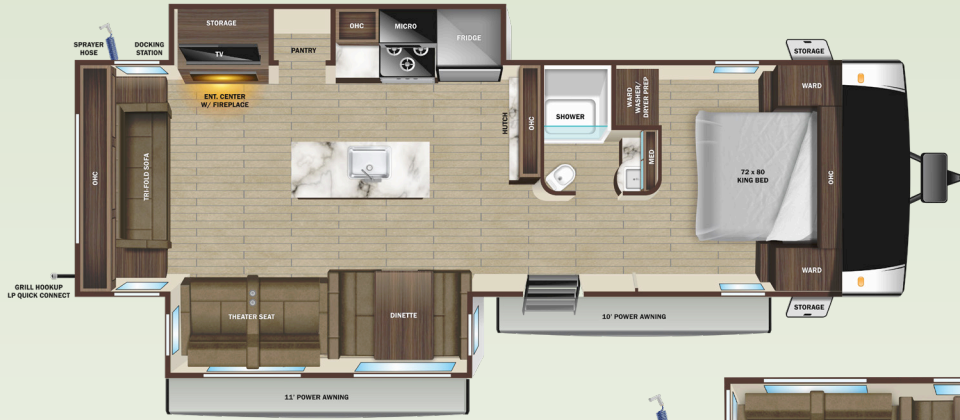
290RLS OPTIONS A, C & D