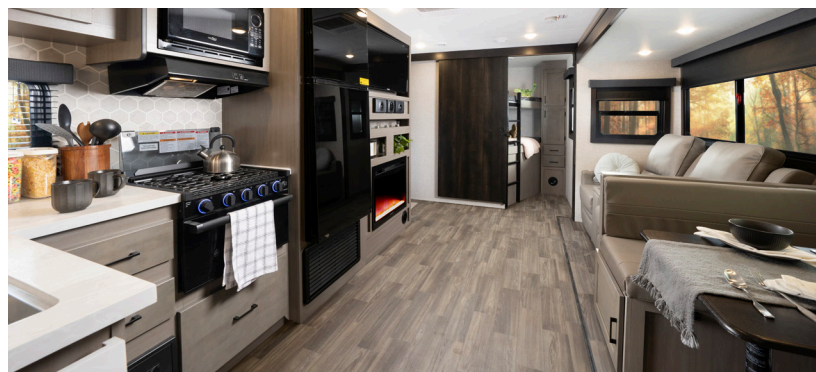
2024 Starcraft GSL TT 296BHS