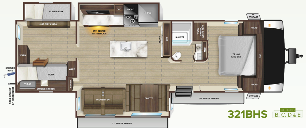
321BHS OPTIONS B, C, D & E