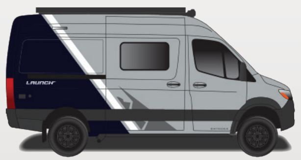
Mystic Tide Partial Paint (Blue-Grey Van Only)