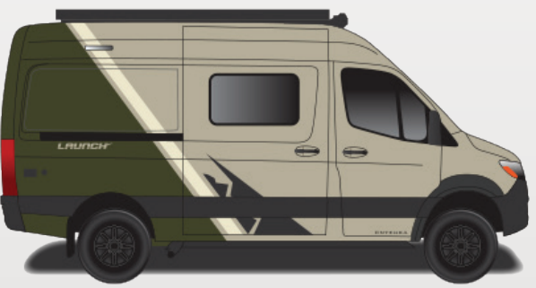
Forest Glade Partial Paint (Sandstone Van Only)