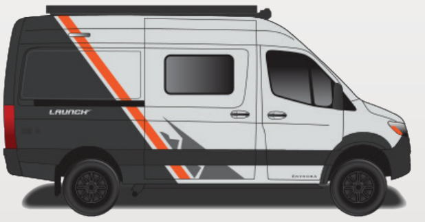
Aztec Partial Paint (Silver Van Only)