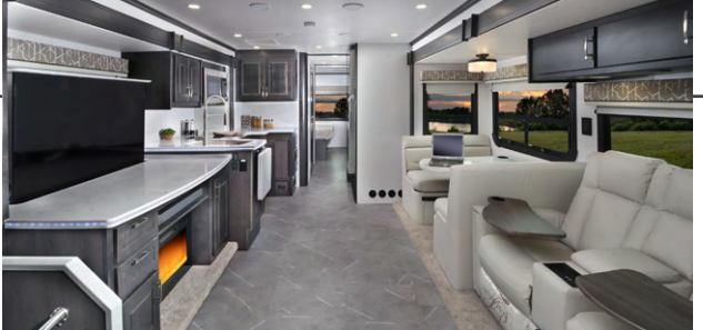
DX3 37TS with Shadow Cabinetry and Milano décor is shown with the Optional Entertainment Center with 50" LED TV and Fireplace.