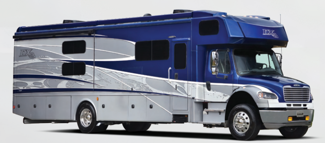
Extended Front Cap with Cab-Over Bunk