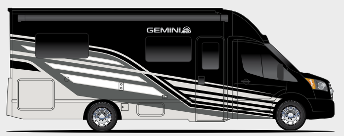
WROUGHT IRON FULL-BODY PAINT