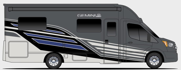
LAPIS BLUE FULL-BODY PAINT