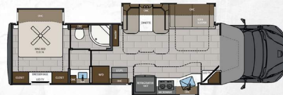
38LDG | 38' MID BATH, 3 SLIDES