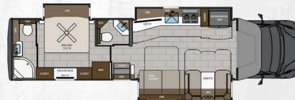
40LRB | 40' BATH AND A HALF, 3 SLIDES