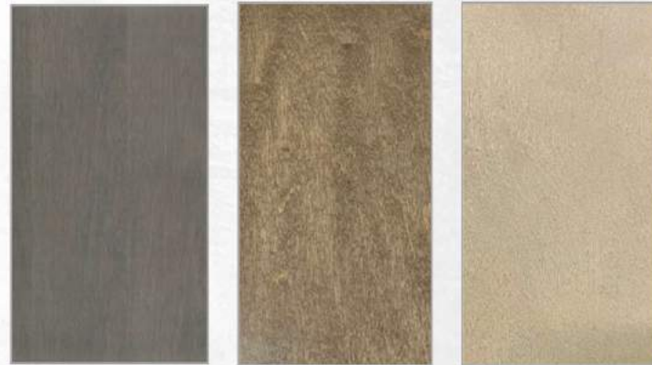
ROCKPORT LAKEWOOD CAPE COD