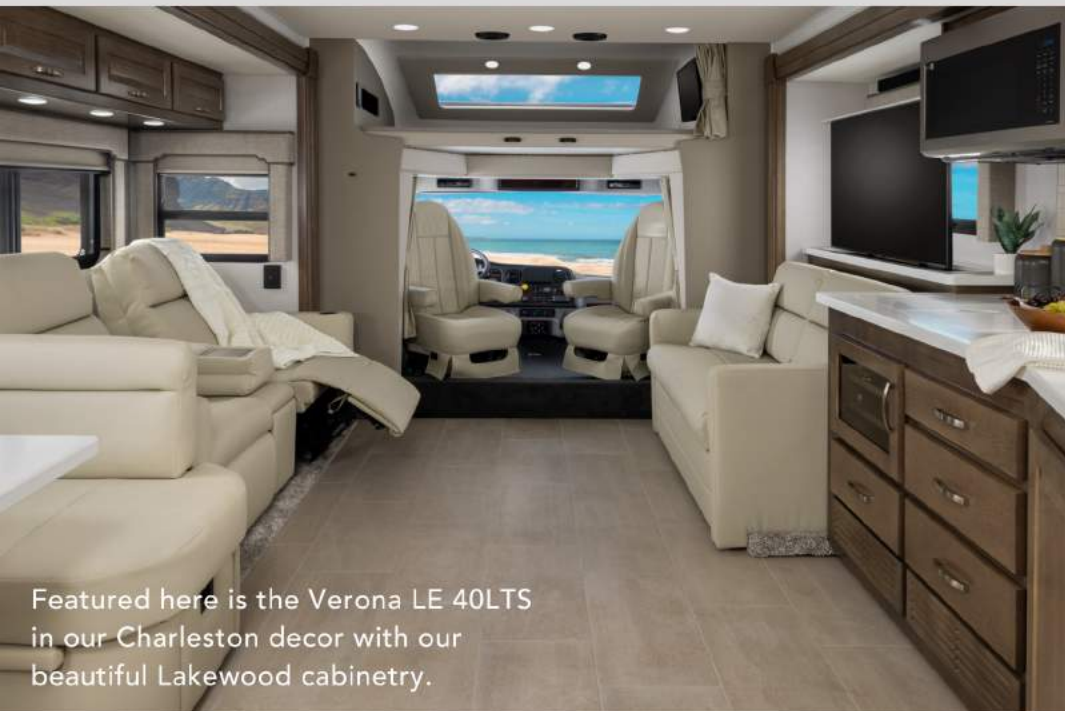
Featured here is the Verona LE 40LTS in our Charleston decor with our beautiful Lakewood cabinetry.

SURROUND YOURSELF WITH THE SPACE YOU DESERVE WHILE MAINTAINING EXCEPTIONAL QUALITY AND DESIGN IN THE VERONA LE. THIS SPACIOUS UNIT FEATURES HIDDEN SLEEPING AREAS, POLISHED SOLID SURFACE COUNTERTOPS, SOLID HARDWOOD CABINETS AND TILE BACKSPLASH. A FULL BATH AND PLENTY OF STORAGE ALLOW YOU TO ENJOY ALL THE COMFORTS OF HOME WHILE ON THE ROAD. THE VERONA LE HAS EVERYTHING YOU NEED IN AN RV.