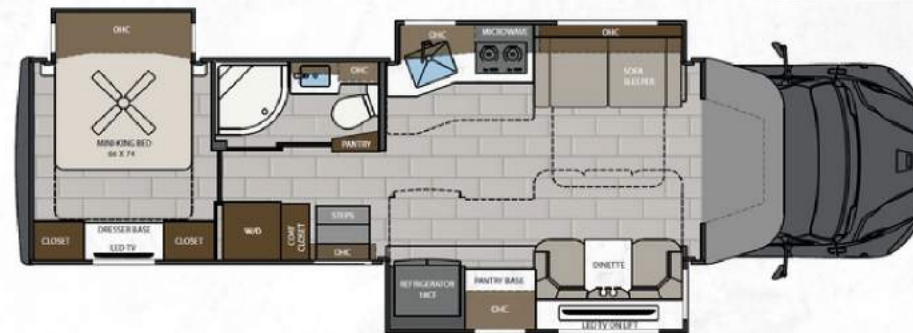
37LMB | 37' MID BATH, 3 SLIDES