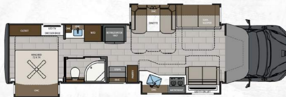
40LTS | 40' MID BATH, 3 SLIDES