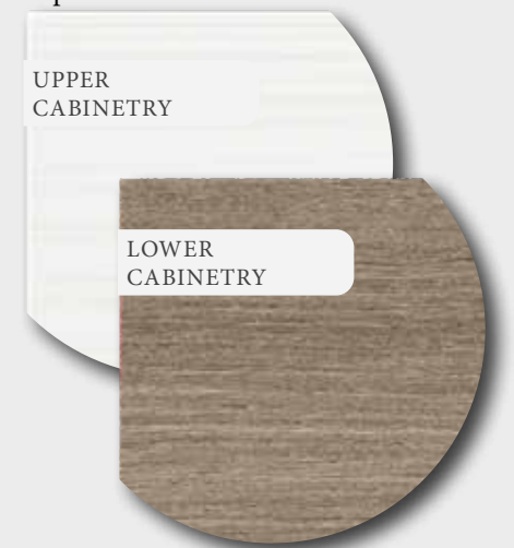
Charcoal Fusion II