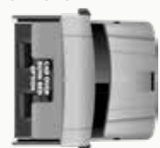
DUAL POWER THEATER SEATS