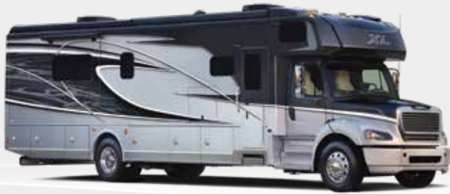
Extended Front Cap with Cab-Over Bunk