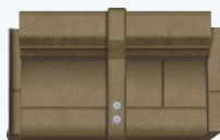
THEATER SEAT OPTION