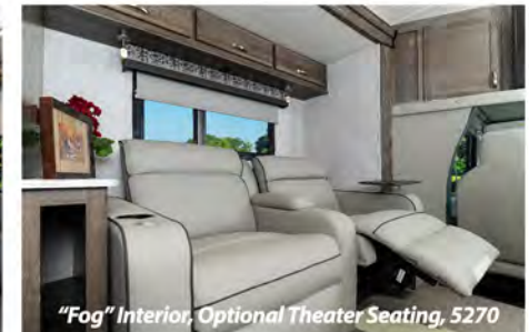
"Fog" Interior, Optional Theater Seating, 5270