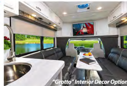
"Grotto" Interior Decor Option