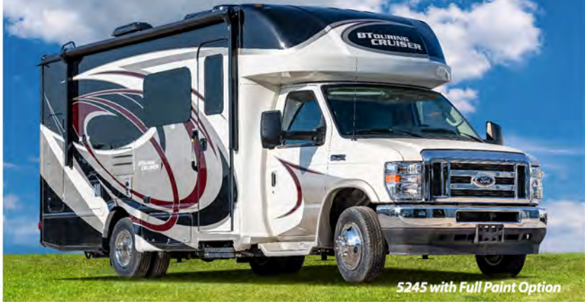
5245 with Full Paint Option