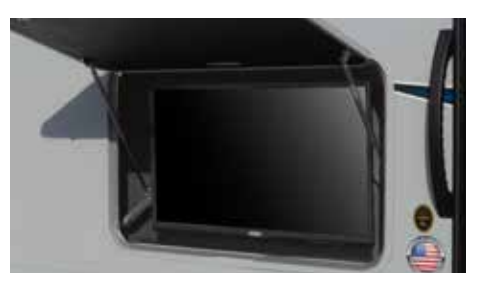
The outdoor entertainment system (N/A 27XPS, 29XPS) is perfect for watching the game outside while the dash includes a computer workstation with 12V, 110V, and USB outlets, perfect for when you want to stay connected.